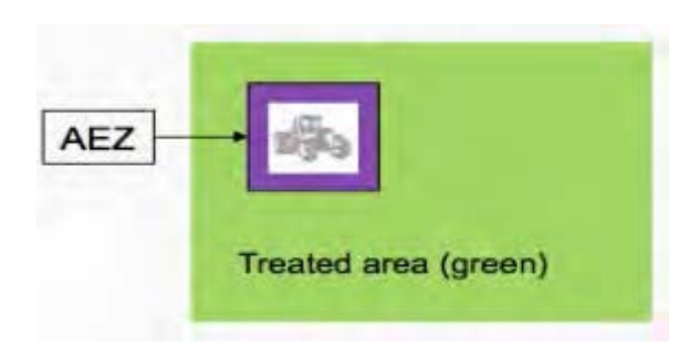
The AEZ is the purple area around the application equipment. It moves with the application equipment as it proceeds. The AEZ is generally within the treated area, except when the application equipment is near the edges of the treated area.

A: The AEZ is measured from the application equipment. The AEZ also moves with the application equipment like a halo around the application equipment.