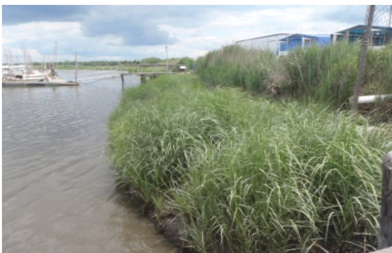
Marsh restoration efforts restore shoreline in New Jersey.