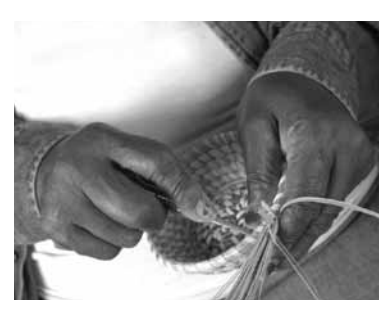
Cultural practices, like basket weaving, may lead to a unique exposure pathway.

Unique Exposure Pathways. An exposure pathway is the route a substance takes from its source to its endpoint. Some populations sustain unique environmental exposures because of practices linked to their cultural background or socioeconomic status. For example, as a cultural practice, some indigenous populations rely on a diet that may include subsistence fishing and/or farming. Subsistence diets may expose these populations to toxic chemicals, such as mercury from a fish diet or other chemicals from a diet high in contaminated vegetation. There are also nondietary exposure pathways that may be unique to some