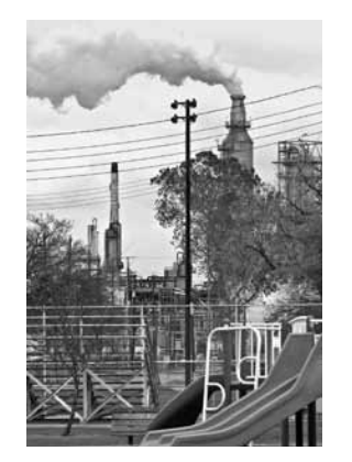
Proximity to industrial sources can cause respiratory illnesses.

Susceptible Populations. Susceptible populations are groups that are at a high risk of suffering the adverse effects of environmental hazards. Certain factors may render different groups less able to resist or tolerate an environmental stressor. These susceptibility factors may be intrinsic in nature, based on age, sex, genetics, race, or ethnicity. In addition, some susceptibility factors may be acquired (such as chronic medical conditions, lack of health care access, poor nutrition, or fitness)