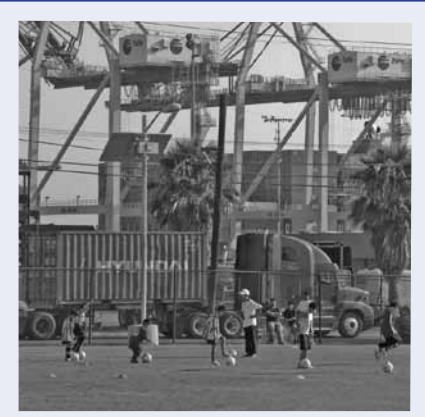
Figure 1—I-710 Freeway Los Angeles