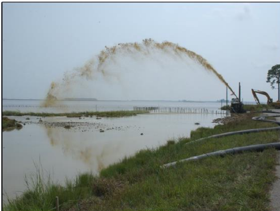
Hydraulic dredge spraying thin layer of dredged material

Enhanced natural recovery – Use of a thin layer of sand to cover the less contaminated areas and speed-up the natural recovery process. Amendments like activated carbon or other material may be added to the cap material to make the remaining contamination less harmful to bottom-dwelling organisms.