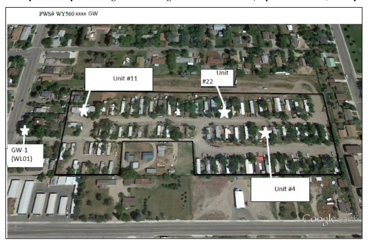
Example #1: Map for a Single Source/Single Distribution PWS (Population ≤ 1000; 1 sample/month)