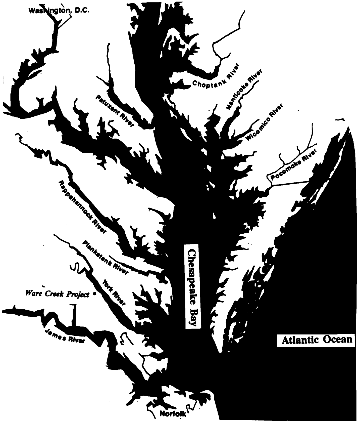
FIGURE 1. Location of Ware Creek project on a regional scale.