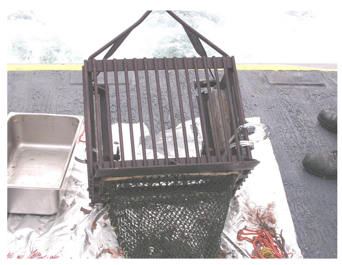
Figure 3: Rocking Chair Clam Dredge