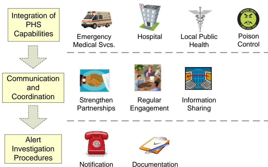
Figure 2. PHS Design Elements

The major design elements for PHS are shown in Figure 2 and described under the remainder of this topic.