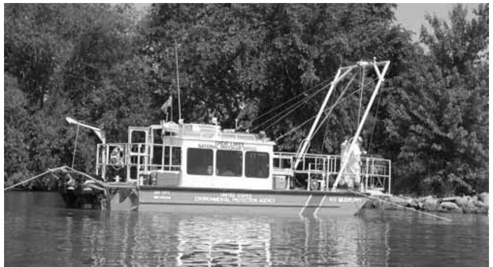
EPA's Mudpuppy was used to collect sediment samples from the Black Lagoon.