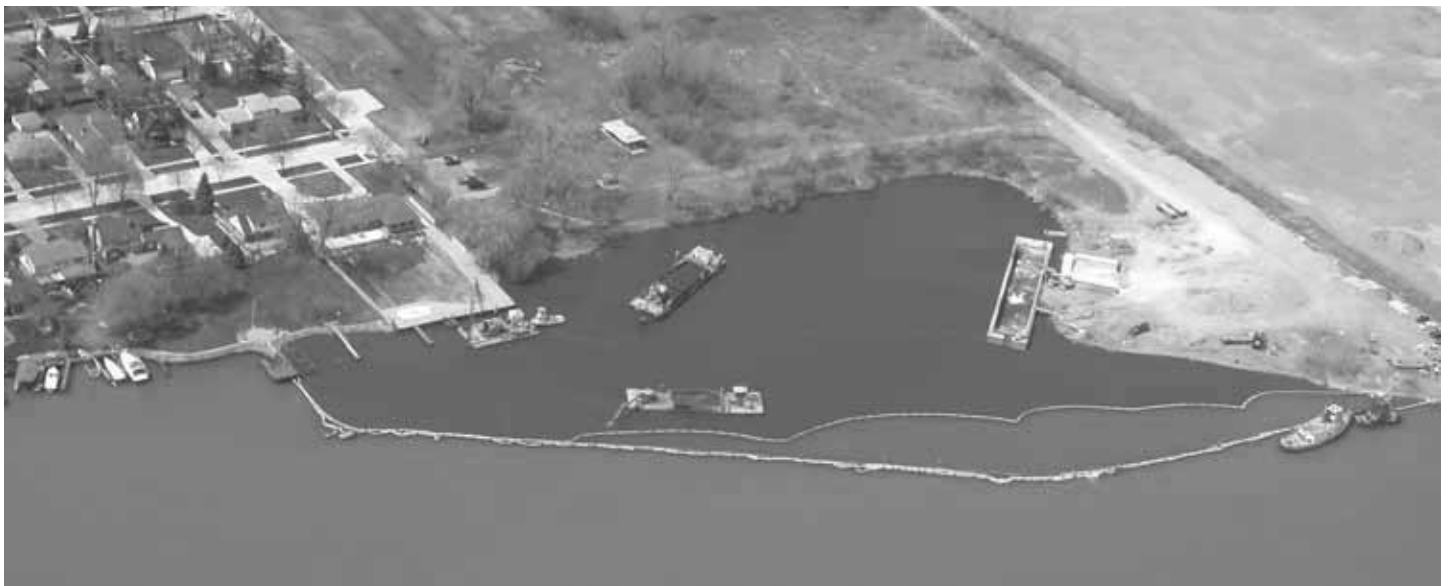
This photo shows the silt curtain that was constructed around the Black Lagoon to keep resuspended sediment from entering the river.