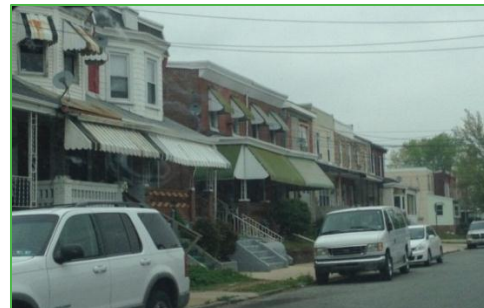
Figure 6: Homes located in Chester, Pennsylvania.

For more information, please contact Dave Campbell, EPA Region 3, campbell.dave@epa.gov .