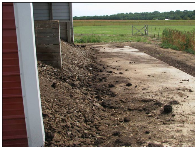
Photo 9. This storage structure may have inadequate capacity for the amount of litter being stored. The area around the storage shed drains to a water of the U.S. and does not have any runoff controls.