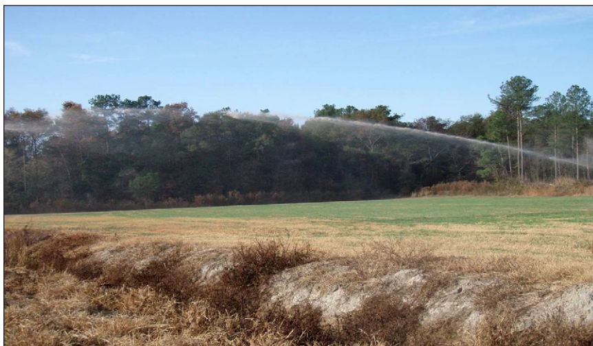
Photo 4. This CAFO is discharging during dry weather by spraying manure/wastewater into a ditch that flows to a water of the U.S. In addition, inadequate edge-of-field conservation practices may be insufficient to control runoff (see § 122.42(e)(1)(vi)), to the extent necessary to qualify as agricultural stormwater discharges (see § 122.23(e)).

Recordkeeping for Land Application Area(s). For discharges from CAFO land application areas to qualify for the agricultural stormwater exemption the CAFO must maintain records in accordance with 40 CFR 122.42(e)(1)(ix). (Also see §122.23(e).) Written records of application amounts, timing, crop nutrient needs, soil and manure testing, conservation practices and other important factors are essential for an assessment of whether there are point source discharges from a CAFO's land application areas. Typical documentation of how a CAFO implements in-field and edge-of-field conservation practices could include records related to maintenance of terraces, vegetated buffers, riparian buffers or other practices.