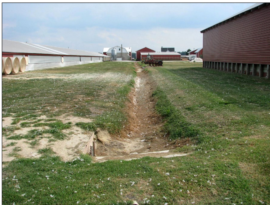
Photo 10. The photo shows a poultry operation that was designed to have precipitation drain away from houses through a conveyance system that discharges to a water of the U.S. If pollutants will be carried by this conveyance system to waters of the U.S., the facility is proposing to discharge.

See the text box on page 14 for other design, construction, operation, and maintenance factors specific to poultry operations.