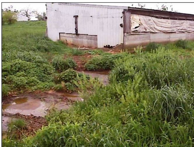
Photo 8. An in-house pit in this swine barn is designed to have manure transported from the pit to an earthen storage structure through a pipe. Due to a pipe break, manure is leaking and flowing downhill from the barn.

Other swine operations have in-house pits that provide only temporary containment before removal of the manure and wastewater to a pond, lagoon, or above-ground storage tank. Therefore, systems at some swine operations rely more heavily on pumps and pipes than at other swine operations. Problems associated with the following aspects of manure management have been known to lead to discharges and therefore should be considered when evaluating whether an operation discharges or proposes to discharge: pipe or hose ruptures; overflows from open channels or collection pits; and direct discharges from a waste containment structure such as a lagoon. See photo 8.