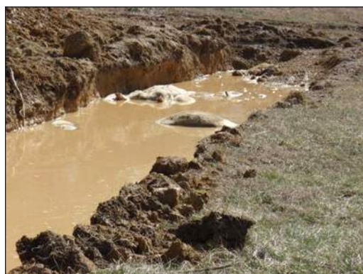
Photo 3. This CAFO is discharging by disposing of mortalities in a conveyance that drains to a water of the U.S.

The CAFO's production area also includes "any area used in the storage, handling, treatment, or disposal of mortalities." 40 CFR 122.23(b)(8). Relevant factors to consider in assessing whether the CAFO discharges or proposes to discharge in connection with mortality management include the type(s) of animal(s) maintained at the operation, methods for handling and disposal of animal mortalities, state and local laws, mortality rate, storage capabilities and other site specific factors. For example, if a CAFO relies on a rendering facility to pick up carcasses, the CAFO owner or operator should consider whether the CAFO has adequate storage to accommodate all mortalities between pick-ups and whether the storage