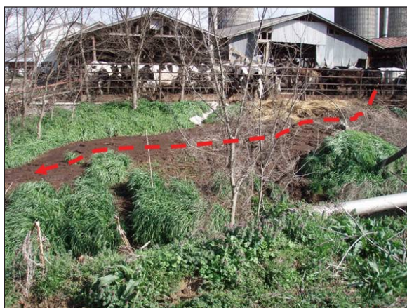
Photo 5. The dairy CAFO pictured above has had discharges from the confinement area bypassing the waste containment storage structure (denoted by red dashed line).

Dairy operations have design and construction considerations that are relevant to the determination of whether the CAFO discharges or proposes to discharge. For example, a dairy operation constructed with floor drains or catch basins that outlet to a surface water is a CAFO that discharges. Therefore, it is important to consider whether a dairy directs waste streams from barns to a proper containment structure or if waste is managed in a manner causing it to be discharged from the barns, including the milking parlor, through a conveyance to a water of the U.S. Additionally, dairies should consider whether all process-generated wastewater is contained, including wastewater from commodity barns and silage bunkers and from portions of the production area that are uncovered, such as feed storage areas, animal pens and loafing areas. See photo 5.