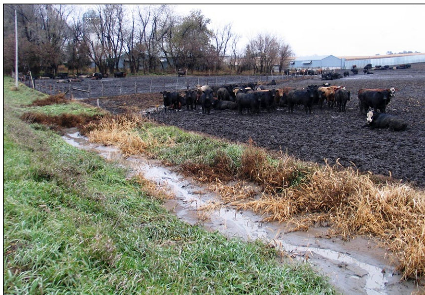
Photo 7. This section of the beef feedlot production area has an outlet for manure and process wastewater to a roadside ditch. If the ditch is, or conveys process wastewater to, a water of the U.S., then the CAFO discharges or proposes to discharge.

determining whether a beef cattle operation discharges or proposes to discharge, an important consideration is if the feedlot has sufficient containment for all manure, wastewater and direct precipitation for the minimum critical storage period. Because the animals and manure are typically not housed under roof at beef cattle operations it is particularly important to consider climate and proximity to waters of the U.S. when evaluating whether beef cattle operations propose to discharge, as well as the design of the animal pens, which at some operations are sloped to drain to waters of U.S.