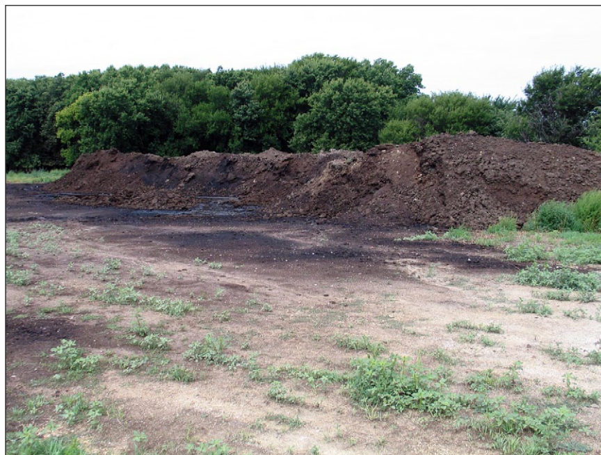
Photo 1. This stockpile is up to eight feet tall and sixty feet long without cover or containment. A creek runs through the wooded area behind the pile. Any runoff from the stockpile to waters of the U.S. would be a discharge from the CAFO.

Waste storage and handling practices differ depending on whether the CAFO's waste handling system is dry, liquid, or a combination of the two. For dry manure handling systems, it is important to consider