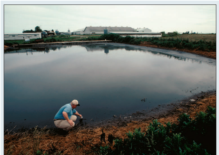
Sampling of wastewater from a lagoon on a hog farm.

When developing the monitoring requirements for NPDES permits, the permit writer should address the routine operational characteristics of the facility and the minimum reporting requirements at 40 CFR part 122.41(l). The ELG includes specific monitoring requirements for daily and weekly visual inspections of specific aspects of the production area and monitoring requirements associated with land application, including manure and soil analysis and land application equipment inspection. 40 CFR §§ 412.37, 412.47. Although the ELG requirements apply only to Large CAFOs subject to Part 412 subparts C and D, the permit writer should consider those as a starting point when establishing BPJ requirements for other permitted CAFOs. The permit should also include monitoring requirements that address nonroutine activities. For example, discharges at a CAFO can occur because of an overflow during a catastrophic storm event (which may be an allowable discharge under the terms of the permit) or a leak, breach, overflow, or