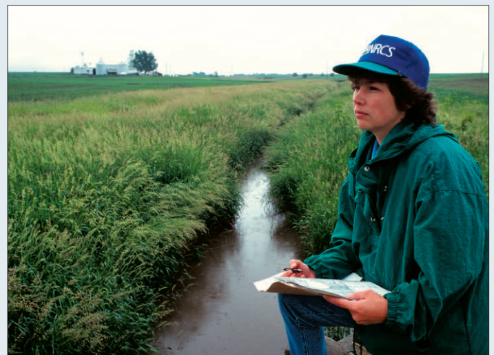
NRCS District Conservationist suggests filter strip as one option to protect the land and improve water quality.

CAFOs are subject to industrial stormwater permitting requirements of 40 CFR part 122.26. Large CAFOs, as defined in 40 CFR parts 122.23 and 412 are included in category (i) of facilities considered to be engaging in industrial activity under part 122.26 (b)(14), which defines 15 categories of “storm water discharge associated with industrial activity.” See 40 CFR part 122.26(b)(14)(i); NPDES Storm Water Program Question and Answer Document Volume 1 (USEPA 1992). As a result, Large CAFOs are subject to the requirements of part 122.26 regardless of whether they are a permitted facility under part 122.23. The requirements of