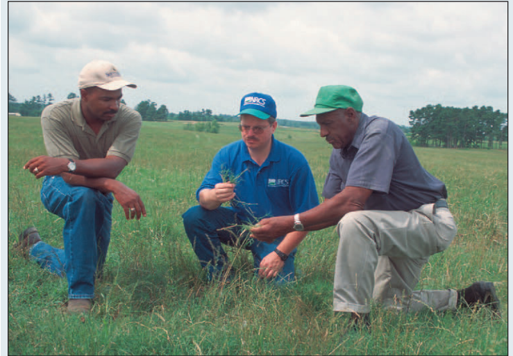
Landowner and an NRCS staff member discuss management options for the land application area.