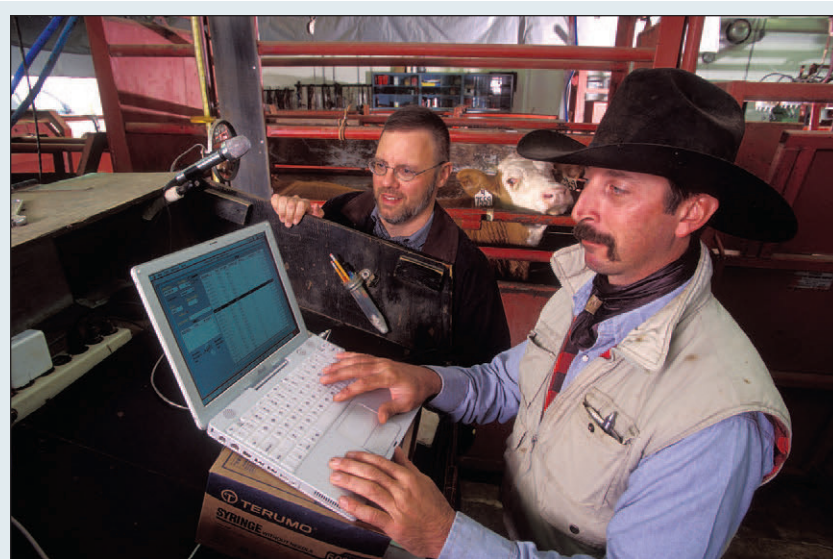
Recordkeeping is an important part of the permitting process.

CAFO operators should maintain in their records a copy of the current NPDES permit and any supplemental documents identified by the permitting authority. Permits should specify that all CAFOs must retain copies of all required documentation. In addition, permits should require that the records be organized in a manner that inspectors can easily review during a compliance inspection, such as the use of a dedicated logbook. The required records for Large CAFOs are listed in Table 4-6 and for Small and Medium CAFOs in Table 4-7. Records must be maintained for 5 years.