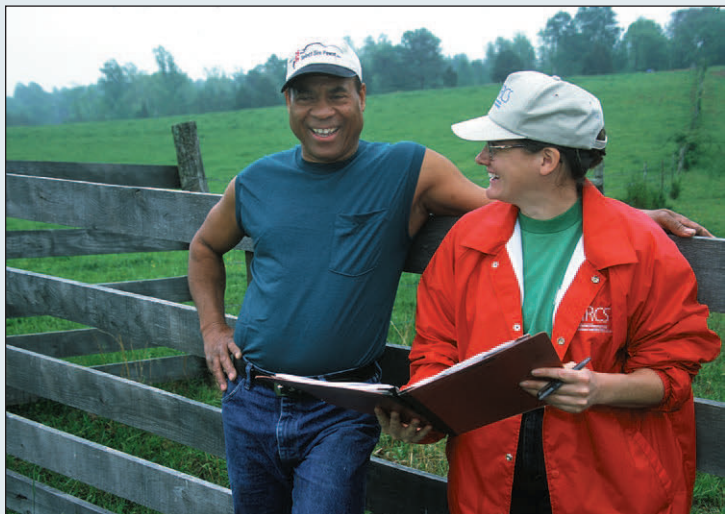
District Conservationist reviewing a conservation plan with a farmer in Orange County, Virginia.

The third substantial change is the addition to the NMP of crops or other uses not previously included in the CAFO's NMP, together with the corresponding maximum field-specific rates of application for those crops or other uses. Because rates of application are based on the yield goals for each specific crop, any crops or other uses that are added to the plan will require corresponding newly calculated rates of application. In addition, because the maximum rates of application must be made available to the public for review before incorporation as terms of the permit, the addition of new crops or other uses and their corresponding rates of application is considered a substantial change.