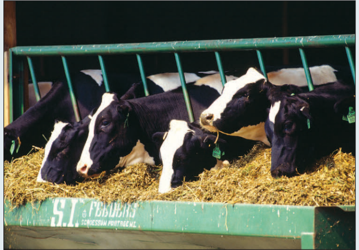
Holstein dairy cows.

This provision applies only to discharges from the production area. The provision for alternative performance standards allows a CAFO owner or operator to request from the Director NPDES permit effluent limitations according to site-specific alternative technologies where the CAFO can establish that the alternative technologies will achieve a quantity of pollutants discharged from the production area equal to or less than the quantity of pollutants that would be discharged under applicable baseline effluent guidelines performance standards.