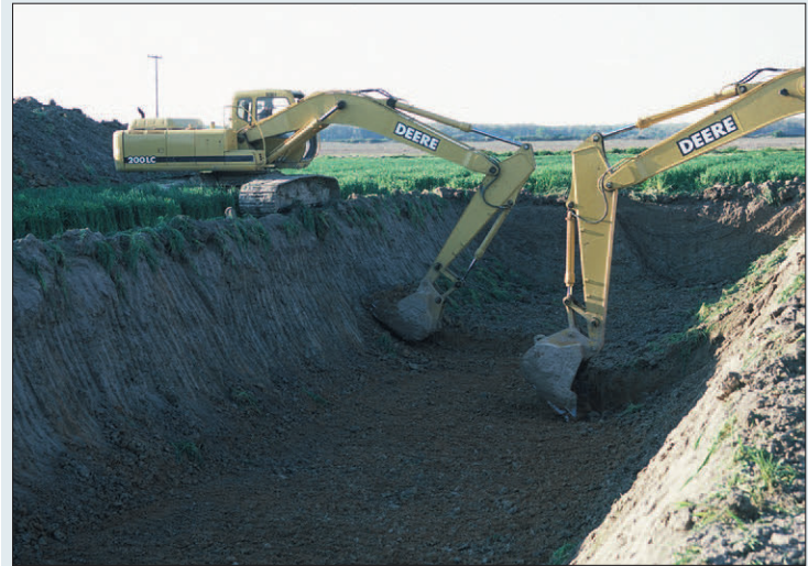
Construction of a storage pond at a farm in Lonoke County, Arkansas.

The regulation at 40 CFR part 412 contains the ELG applicable to CAFOs. The CAFO ELG establishes the technology-based effluent limitations and new source performance standards (NSPS) for those operations that meet the regulatory definition of a Large CAFO. 1