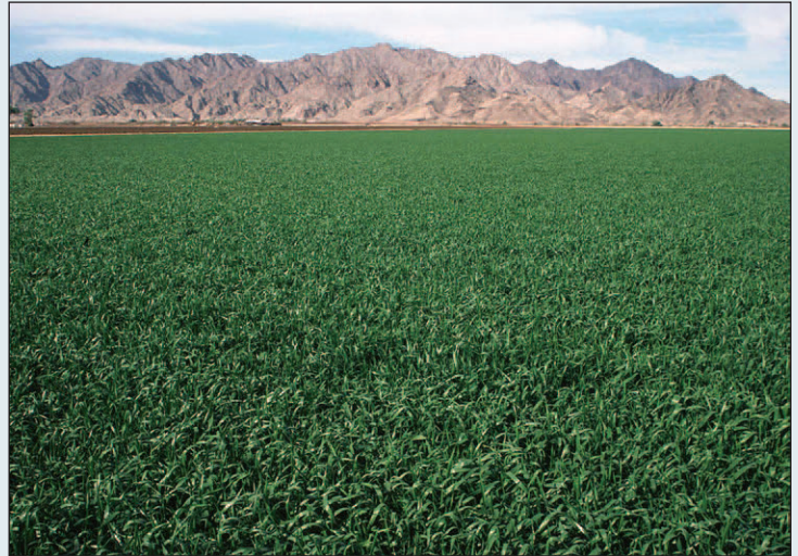
Precipitation related runoff from a land application area where manure has been applied in accordance with an NMP is exempt as agricultural stormwater.

The site-specific application rates for manure must be developed in accordance with technical standards established by the Director. 40 CFR § 412.4(c)(2). The rates must also be identified in the facility's NPDES permit as enforceable terms following either the linear approach or narrative rate approach (73 FR 70420). The technical standards are discussed in Chapter 6.3.1, and site-specific rates of application are discussed in Chapter 6.5.