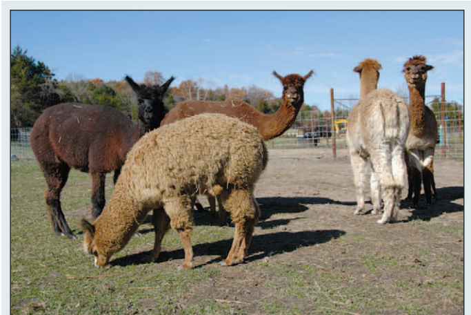
Alpaca farm.

NPDES permit limitations are based on BPJ when national ELGs have not been issued pertaining to an industrial category or process. Specifically, the NPDES regulations require a permit writer to establish permit limitations on a case-by-case BPJ basis when ELGs are inapplicable, or in combination with the effluent guidelines, where the ELG apply to only certain aspects of the operation or certain pollutants. CWA § 402(a)(1); 40 CFR § 122.44(k).