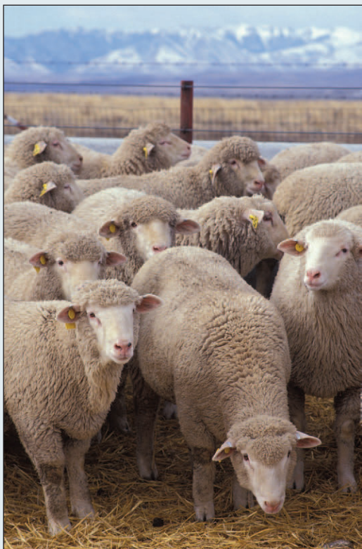
Flock of sheep near Dubois, Idaho.

To ensure that a facility meets the no-discharge standard, the CAFO must ensure that the production area has adequate storage structures that are designed, constructed, operated, and maintained to contain all manure including the runoff and direct precipitation from a 25-year, 24-hour rainfall event. An important consideration as to whether the CAFO meets