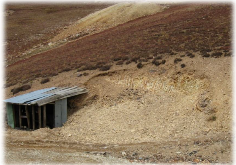
Number 1 Portal backfilled

One change order was issued on 9/17/2009 to increase the project cost by $14,980.00. There were two increases in cost to the project budget. The concrete lined ditch needed additional concrete work to make the ditch larger in order to carry the larger than estimated quantity of mine drainage for an increased cost of $12,480.00. The well point installed in the Level Seven Old Portal was also an additional cost of $2,500.00. The entire bond amount was expended on this project and the additional funding ($2,082.74) came from the State Appropriated Bond Forfeiture Severance Tax.