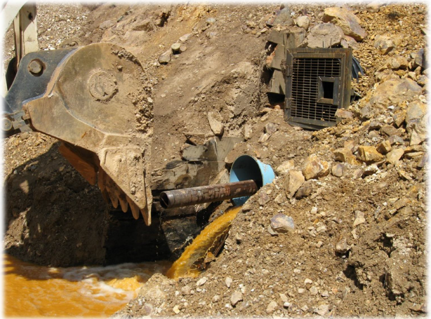
Gold King Level 7 Old Portal with well-point installed through the drain pipe. This portal may be re-opened in a future project to help stabilize the mine drainage and prevent future increases in mine pool head .

The mine drainage at the Gold King Level 7 Mine contains extremely high levels of metals and continues to flow between 150 and 300 gallons per minute. The mine drainage began after bulkheads were installed in the American Tunnel in 1995, which previously deep-drained the mining district. The mine drainage and the collapse at the Level 7 Old Portal continues to be of concern to the landowner, DRMS, and ARSG. A future project at the site may attempt to cooperatively open the Level 7 Old Portal in an effort to alleviate the potential for an unstable increase in mine pool head within the Gold King workings.