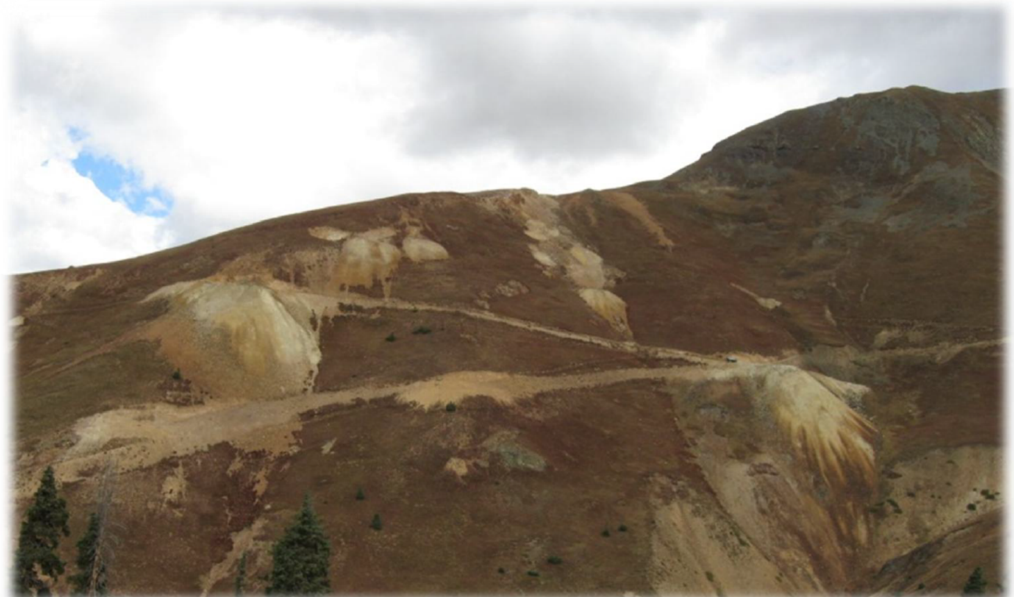
Sampson Portal, Drill Road, and Number 1 Portal as viewed from access road after reclamation. Drill Road has been re-contoured and revegetated in this photo.