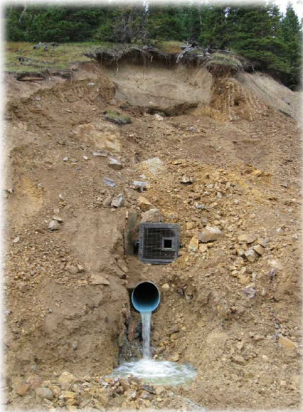
Gold King Level 7 Old Portal Closure