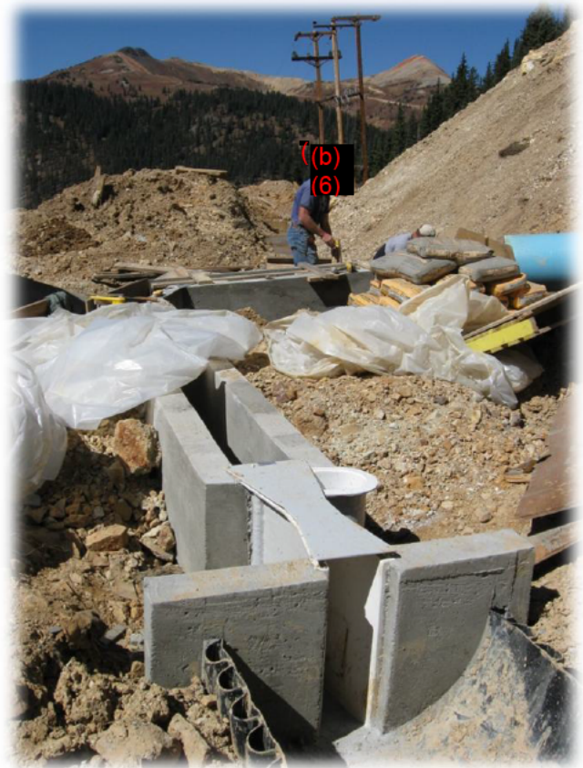
Gold King Level 7 Old Portal with 2" Parshall Flume Installed in Concrete Lined Ditch