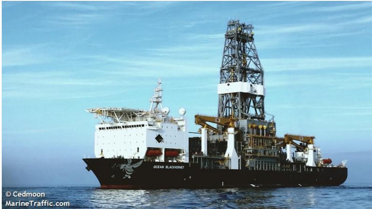
Figure 3-1 Drilling Vessel