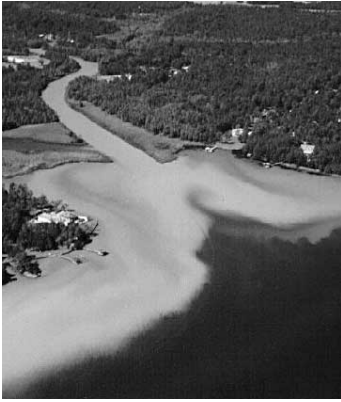
As stormwater enters an estuary, it often creates a plume of highly turbid water. In this photo, a plume of stormwater delivers large amounts of dissolved and suspended materials to an estuary.

at enough representative sites so that the data will account for most of the inherent variability within the system.