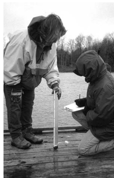
Using a transparency tube is an easy way to measure the water transparency. It is especially useful in water that is too shallow for a Secchi disk (photo by K. Register).