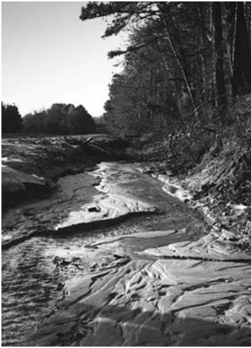
Land use decisions throughout an estuary's watershed impact water quality. Here, extensive erosion near a highway adds to the sediment entering a nearby estuary.

Turbidity is a measure of water clarity: how much the material suspended in water decreases the passage of light through the water. Suspended materials include soil particles (clay, silt, and sand), algae, plankton, and other substances. They are typically in the size range of 0.004 mm (clay) to 1.0 mm (sand).