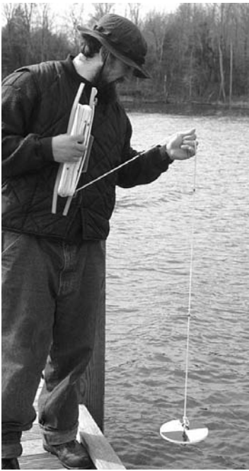
A volunteer uses a Secchi disk from the shady side of a dock.