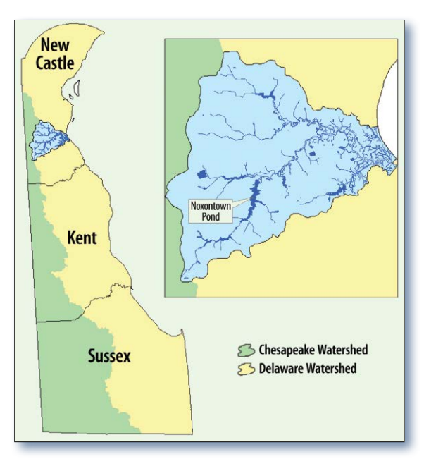
Figure 1. Noxontown Pond is one of four major ponds in the watershed that flow into Appoquinimink River in northern Delaware.

Monitoring data collected in the late-1990s indicated that Noxontown Pond failed to meet the state's enterococcus bacteria numeric criterion, which requires that the annual geometric mean be less than 100 colony-forming units (CFU) per 100 milliliters (mL). The pond did not support its freshwater primary contact designated use, prompting the state in 1998 to add the pond to Delaware's CWA section 303(d) list of impaired waters for bacteria. The pond was also listed as impaired for nutrients in 1998.