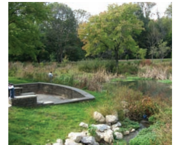
Figure 2: Stormwater park at Saylor Grove in Philadelphia

In some urban areas, a city or sewer authority may determine that it will focus on relatively larger green infrastructure practices, perhaps at the block scale, and will set up ownership and operation of the sites and practices under the direct control of the city