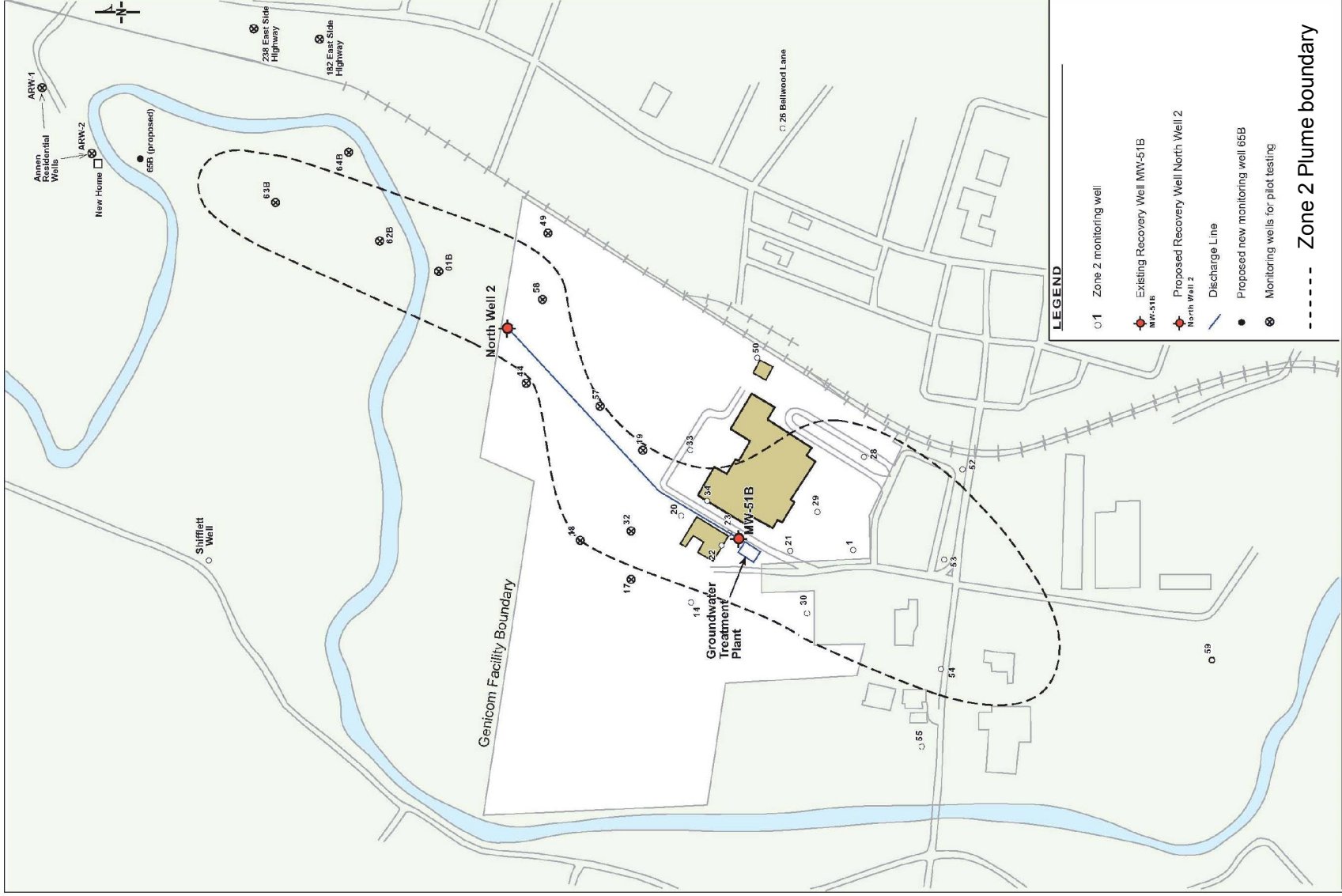
Figure 4 Zone 2 Plume