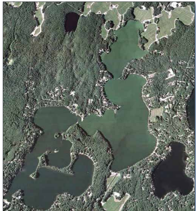
Figure 1. Southeastern Massachusetts' White Island Pond is comprised of two main basins: the West Basin (lower left) and the East Basin (upper right).

Data collected in 2000 and 2007 showed continued nutrient-related problems in the pond. Fertilizer applied on nearby commercial cranberry operations contributed nutrients to the East Basin, which experienced elevated levels of TP concentrations, exhibited frequent algal blooms that caused some