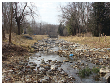
Figure 3. After restoration, the concrete channel seen in Figure 2 has been removed. Sewer lines running along both sides of the stream prevented partners from restoring a natural meandering pattern.