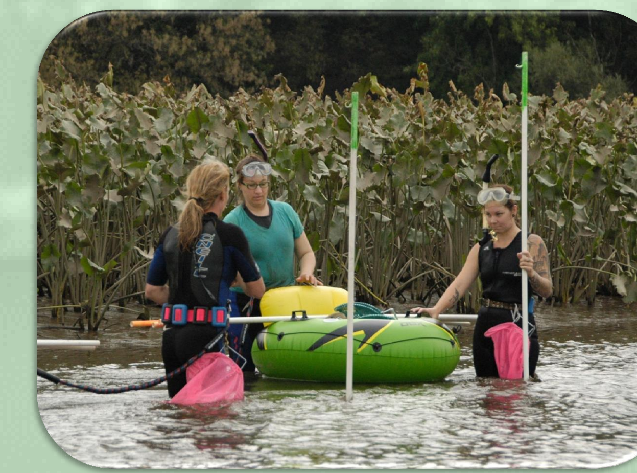
Figure 3. PDE staff record the locations and sizes of native species of freshwater mussels in 2013.