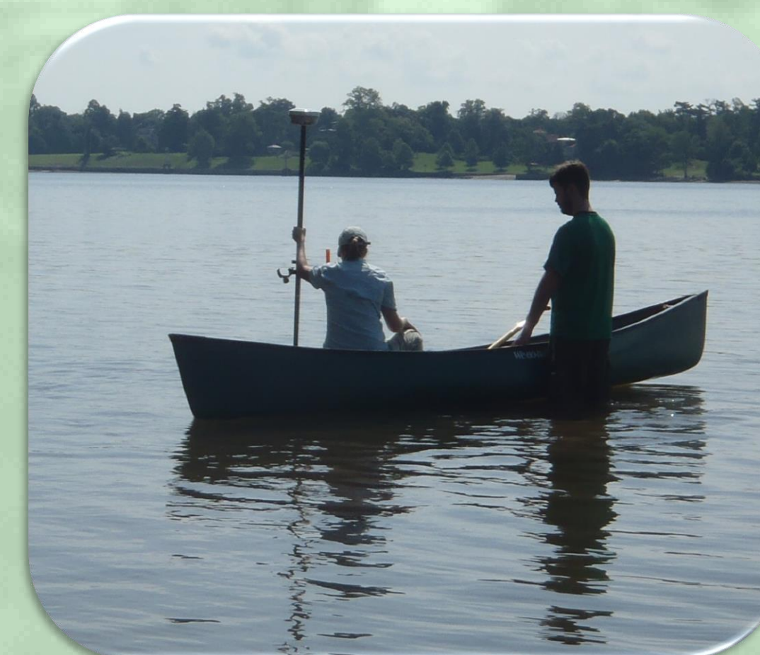
Figure 2. RTK-GPS surveys of intertidal and shallow subtidal elevations.

This project examined which flora, fauna and habitat types exist within the urbanized Delaware River waterfront that might be targeted for use in living shoreline projects. Initial concepts have been suggested for two potential sites in Camden, New Jersey: Harrison Avenue Landfill and Phoenix Park.