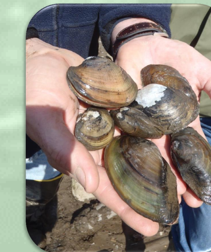
Figure 4. Frank McLaughlin holds examples of mussels found at the Harrison site, including scarce species, in April 2013.