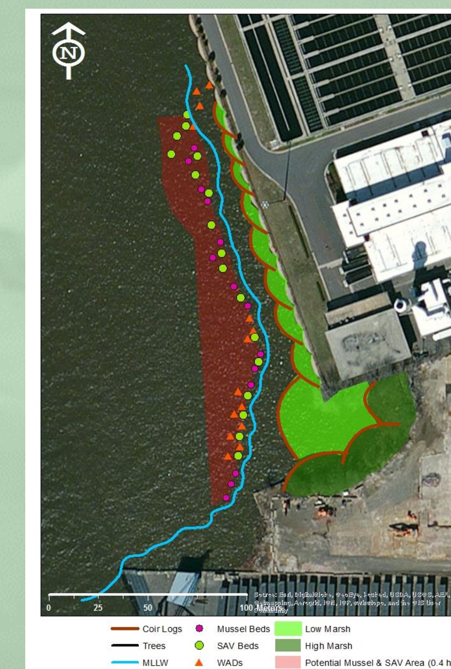
Figure 8. Conceptual diagram for a hybrid living shoreline at the Phoenix Park site in South Camden, New Jersey. The project would expand intertidal high and low marsh and encourage subtidal communities of SAV and freshwater mussels.