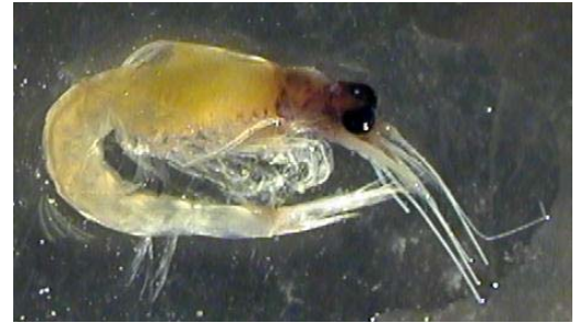
Lower trophic level organism ( Mysis )

Hydroacoustics is the use of sound waves to measure or monitor underwater processes. Sound waves travel great distances underwater without losing strength, making this an effective tool for studying the open waters of Lake Superior. In 2005, the University of Minnesota-Duluth and U.S. Geological Survey (USGS) continued a hydroacoustic assessment that ranked as the highest priority Aquatic Communities project. The objective is to determine the abundance of prey fish important to lake trout. Sound waves sent from the ship toward the lake bottom bounce off objects (fish, in this case) and return to the ship, where biologists interpret the signals. Mid-water trawls are used to catch fish and verify hydroacoustic data. This year, Michigan waters from Whitefish Bay to the tip of the Keweenaw Peninsula were surveyed. Including work in Ontario and Minnesota waters in prior years, over 2,000 km of transects have now been sampled.