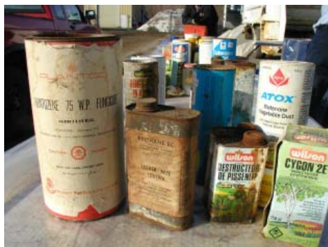
EcoSuperior pesticide collection (Red Rock, ON)