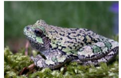
Gray Treefrog

Funding from U.S. EPA-GLNPO will establish and test an intensive monitoring program at several sites within the Lake Superior basin. A data repository will be established, and detection probability statistics will be developed that can be applied to existing programs to advance basin-wide analysis capabilities.