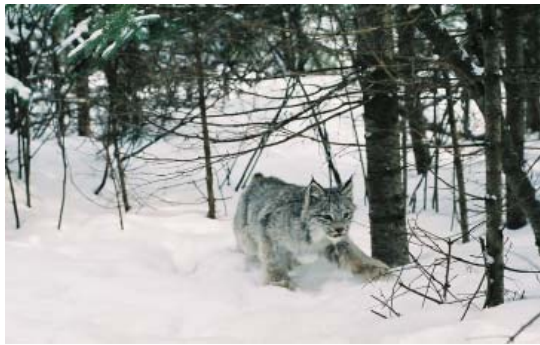
10-month-old lynx kitten in the snow