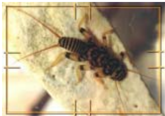
Stonefly nymph (often found in unpolluted streams)

Aerial thermography is being used to survey nearshore areas of Lake Superior, the Nipigon River, and the Lake Nipigon shoreline to locate groundwater upwelling areas, which provide critical habitat for coaster brook trout. Through funding from the Canada-Ontario Agreement (COA), an upwelling survey of the Nipigon River and portions of Lake Nipigon and Nipigon Bay was completed in 2004. A survey from the Pigeon River eastward to Black Bay Peninsula is planned. This information will be used to help protect these critical areas in the future.