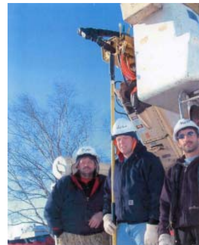
PCB transformer phase-out (Grand Marais, MN)

Minnesota also completed a PCB transformer phase-out project and is in the process of analyzing the results. In addition, residents of Duluth and Two Harbors were offered the opportunity to exchange their burn barrels for a rain barrel and a pledge to stop burning trash.