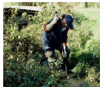
Watercourse Stewardship sampling