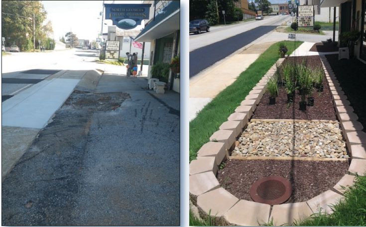
Figure 2. An impervious parking area before construction (left) and the new bioretention area after construction (right) in Clarkesville.

to identify and prioritize infrastructure needs and opportunities for additional stormwater practices. Additionally, a rain garden was installed on public property in the city of Cornelia.