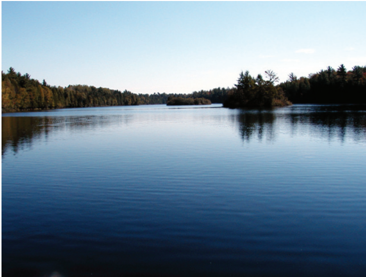
No fish kills have occurred in Bass Lake since best management practices were implemented, and the fish population appears healthy.

of internal phosphorus release from sediment on the lake bottom and to reduce phosphorus levels in the lake.