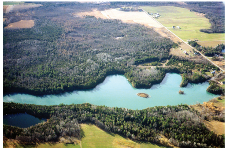
Bass Lake just after alum treatment, which helped reduce phosphorus in the lake.

Marinette County LWCD spearheaded an effort to work with two livestock operations, with a combined total of 700 animal units, identified as the major sources of phosphorus entering the lake. LWCD worked with landowners to install state-of-the-art barnyard control practices such as manure storage facilities, clean water diversions, and roof runoff controls. Eventually, one landowner chose to discontinue operations in his barnyard. Funds from the state stewardship program allowed him to put 2,000 feet of Bass Lake shoreline and 55 acres of cropland under permanent easement. The U.S. Fish and Wildlife Service aided in the installation of sediment