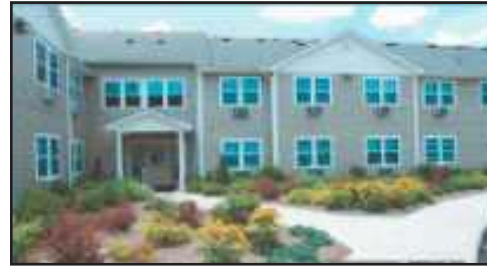
Affordable senior housing in Port Jervis, NY, built after the remediation of a former chemical manufacturing site.

Federal funds may be used to begin brownfield assessments. However, depending on the findings of the site assessment, communities may be able to find developers who are willing to buy the land and redevelop it. These investors might pay for some or all of the site cleanup and necessary infrastructure improvements.