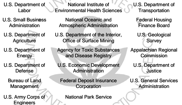
Exhibit 3: Other Major Federal Programs