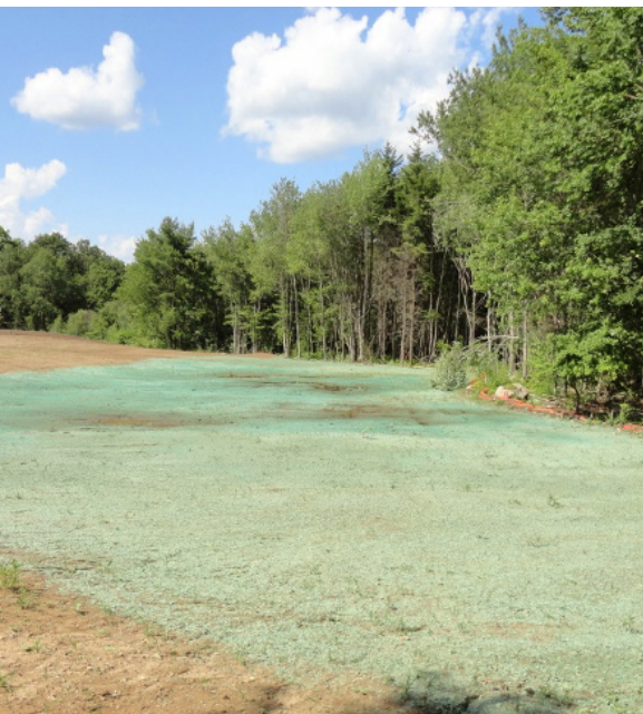
The completed wetland basin now provides an expanded flood plain.

After excavating and remediating the soil, and clearing the wetland basin, crews began landscaping the entire site, installing special wetland plantings, trees, shrubs and evergreens. Crews also constructed a walking path and guard rails, and the town is working to install a 400-foot-long elevated boardwalk that traverses a cedar swamp en route to the Whipple Conservation Area. The town also has plans to install amenities such as park benches and picnic tables by the end of 2015. A parking lot constructed at the entrance to the park can accommodate two dozen cars.