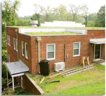
Municipal building green roof