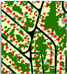
Mapping tree canopy