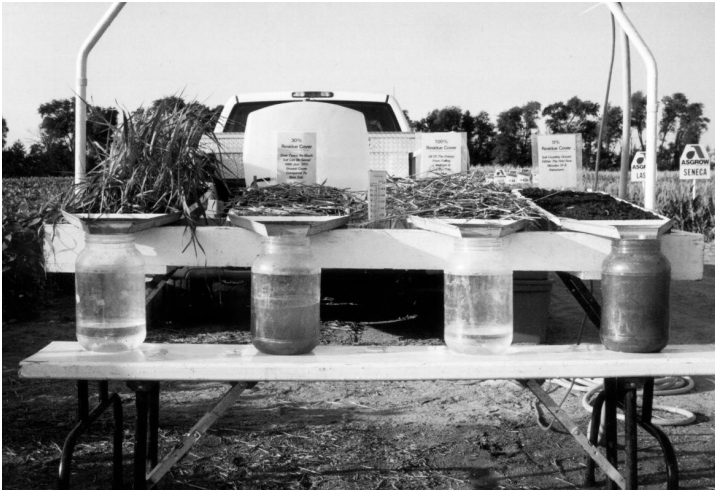
Mermis' homemade model simulates a rainstorm over cropland or construction sites and shows the effects of water running off the exposed and vegetated soil.

Based on a design by Paul , Nebraska Extension engineer, Mermis' simulator showers a 2- to 3-inch rainfall with an oscillating nozzle over five 10" x 20" x 2 1/2" trays of soil with various degrees of residue set at an 11 percent slope. The nozzle creates a droplet close to what occurs in a natural rainstorm. The runoff from a 15-minute rainstorm, collected in clear plastic gallon jugs placed below each tray, shows the positive water quantity and quality benefits of a good crop residue management program.