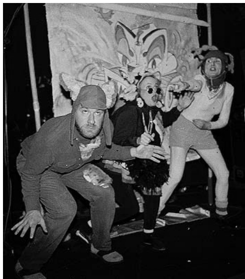
These artists use street theater to get their environmental message across.

The conference also highlighted several examples of the link between art and science on a more local level. Conference presenter Jerry described his efforts to develop a large photographic mural in a community park to protest the development of California’s Laguna Canyon, a unique wild area. Burchfield invited the community to post photographs that represented what they loved about the area. The response was tremendous — the mural included more than 80,000 photographs. It served as a catalyst to energize the community about the need to preserve this environmental