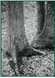
Trees found in swamps are sometimes buttressed at the base, which helps anchor them in the saturated soils.

SWAMPS are fed primarily by surface water inputs and are dominated by trees and shrubs. Swamps occur in either freshwater or saltwater floodplains. They are characterized by very wet soils during the growing season and standing water during certain times of the year. Well-known swamps include Georgia's Okefenokee Swamp and Virginia's Great Dismal Swamp. Swamps are classified as forested, shrub, or mangrove.