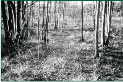
Forested swamps serve a critical role in the watershed by reducing the risk and severity of flooding to downstream areas.

Forested swamps are found in broad floodplains of the northeast, southeast, and south-central United States and receive floodwater from nearby rivers and streams. Common deciduous trees found in these areas include bald cypress, water tupelo, swamp white oak, and red maple.