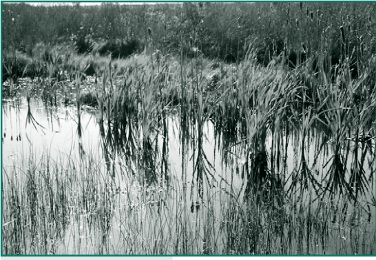
A freshwater pool at Assateague National Seashore in Virginia.

Living systems cleanse water and make it fit, among other things, for human consumption.