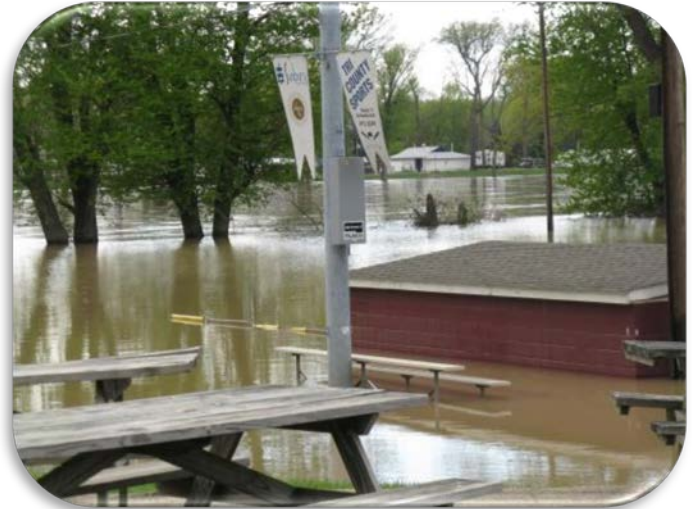
Flooding in 2011: In spring 2011, Tropical Storm Lee and Hurricane Irene wreaked havoc in the Susquehanna Valley. Nowhere was the flooding worse than Liberty Hollow Run.

to utilizing green infrastructure in the hollow's upper reaches, where development is concentrated. The G3 grant helped move the effort along by providing funds to allow the Borough to conduct a green infrastructure study.