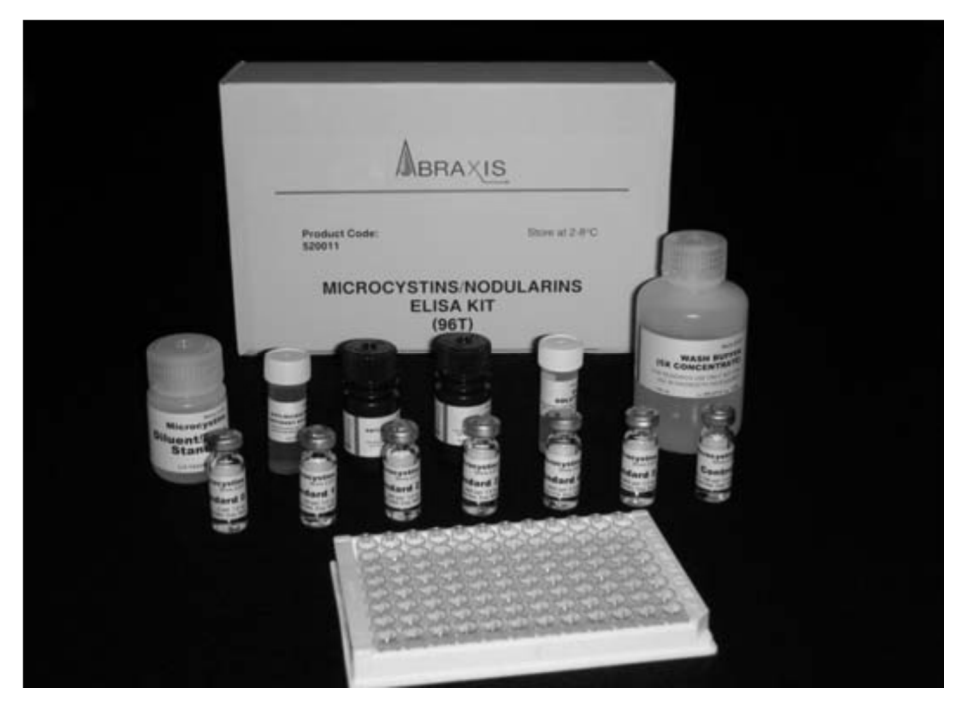
Figure 3.1 Microcystins: Abraxis Test Kit (Converted from color to grayscale from James, page 3, 2010)

This chapter describes an immunoassay procedure that measures concentrations of total microcystins in water samples. In applying the procedure, the laboratory uses Abraxis' Microcystins-ADDA Test Kits (Figure 3.1; "kits"). Each kit is an enzyme-linked immunosorbent assay (ELISA) for the determination of microcystins and nodularins in water samples. Microcystins refers to the entire group of toxins, all of the different congeners, rather than just one congener. Algae can produce one or many different congeners at any one time, including Microcystin-LR (used in the kit's calibration standards), Microcystin-LA, and Microcystin-RR. The different letters on the end signify the chemical structure (each one is slightly different), which makes each congener different.