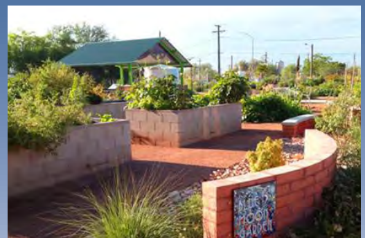
The Blue Moon Community Garden illustrates the conversion of a brownfield into urban agriculture in Tucson, AZ.