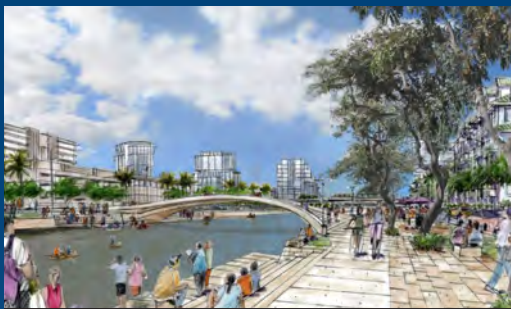
Transit-oriented development is planned along Honolulu's rail transit corridor.

Brownfields Environmental Assessments evaluate the historic use of a property, the likelihood of contamination and, if appropriate, the types and extent of contamination through testing. EPA's Assessment grant will also fund community outreach and cleanup planning.