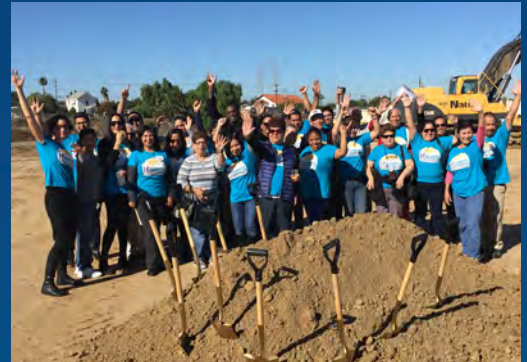
Community members celebrate the groundbreaking of the Paradise Creek project.