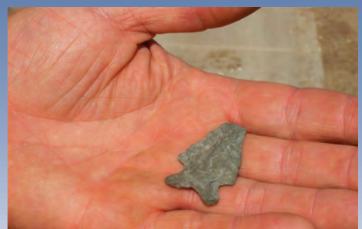
Historic preservation work at Fort Lowell uncovered 73 archeological features from periods spanning 1,000 years.