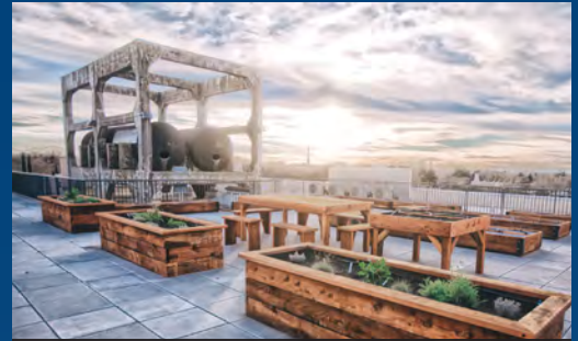
The Warehouse Artist Lofts development is revitalizing the Historic R Street Corridor in Sacramento, CA.

CADA removed 5,000 cubic yards of contaminated soil to a depth of eight feet to safely build apartments on a former brownfield site in Sacramento.