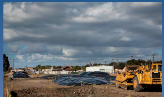
Contaminated soil is removed at the 4.5 acre site that is now the Rumrill Sports Complex.