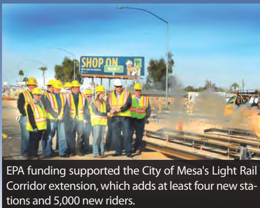
EPA funding supported the City of Mesa's Light Rail Corridor extension, which adds at least four new stations and 5,000 new riders.