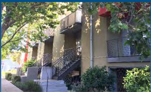
Developers of Emeryville's GreenCity Lofts used a low-interest revolving loan to clean up the site for this mixed-income multifamily development.