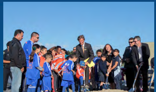
The Rumrill Sports Complex boasts three youth soccer fields, playground, picnic area and a locally operated healthy food vendor.