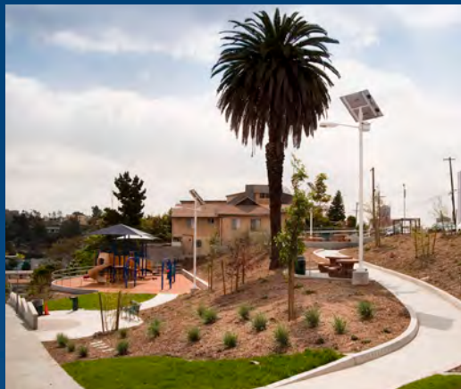
A former petroleum-contaminated site, the Rockwood-Colton Park in Los Angeles has solar lighting and other sustainable features.

The historic town of Samoa, located in the northern peninsula of Humboldt Bay in northern California, is the focus of a lead-contaminated soil cleanup in an area of more than 250 acres. A developer with a vision to restore Samoa and create a vibrant historic community purchased the entire town in 2000. Since 2007, the County of Humboldt has managed an EPA Revolving Loan Fund Grant totaling $2.16 million. The County loaned a developer funding to cleanup lead-contaminated soils and lead-based paint in 100 homes. This project will ultimately preserve historic structures, including the Samoa Cookhouse, and create affordable housing.