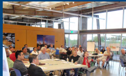
A diverse group of stakeholders gather at the Nina Mason Pulliam Rio Salado Audubon Center, which is within the target area for the Del Rio Area-Wide Planning Grant.