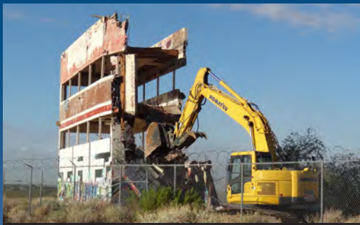
Abatement and demolition at the Beeline Dragway, Scottsdale, AZ.