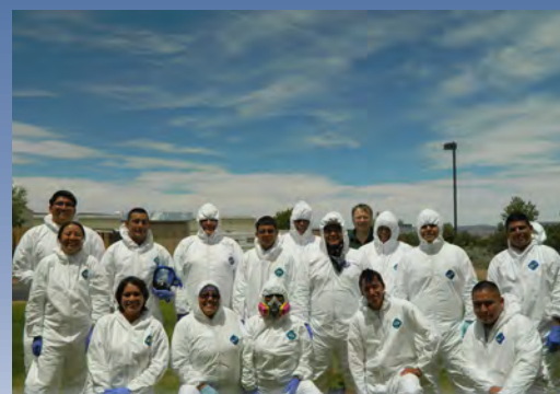
Navajo Nation students complete HAZWOPER training at Northern Arizona University.