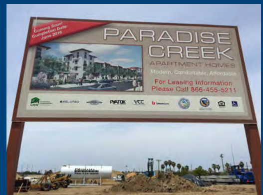
Paradise Creek Apartment Homes are the first sustainably redesigned affordable homes in West-side neighborhood in the City of National City.

At the foundation of this project is the incentivized relocation of industrial uses out of a residential neighborhood. EPA's assessment also included an amortization formula and schedule prioritizing the most polluting and underutilized uses first, which helped the City identify incentive strategies for relocation and closures of non-conforming uses in the neighborhood.