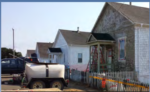
Lead-based paint that peeled off old homes in the historic mill town of Samoa created a health hazard by contaminating soil in the surrounding area.