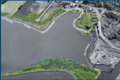
India Basin Waterfront's proposed park provides open space and bay access in an underserved community.