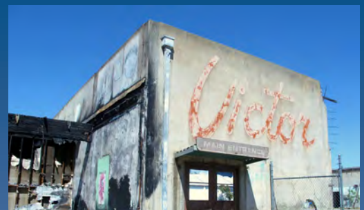
Chico is working to redevelop this key brownfield site as part of a larger effort to support green companies in "The Wedge" business area.