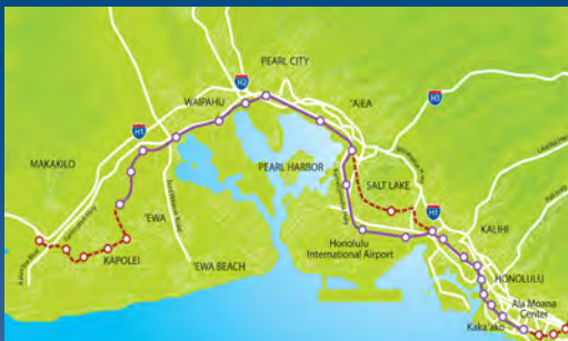
EPA provides funding for 15 environmental assessments at five rail stops from Kapolei to Ala Moana Center in Honolulu.