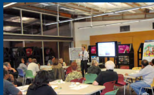
During the development of the Area-Wide Plan for the Del Rio community, extensive community outreach is conducted.

Under the Navajo Nation's EPA-funded program, 36 tribal members completed environmental job training through the Navajo Nation's partnership with Northern Arizona University. The training focused on hazardous materials cleanup and management. Students took additional radiological training to gain the skills necessary to work on the cleanup of former uranium mines on the Navajo Nation.