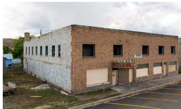
The State Hotel in Carlin, NV was assessed under an EPA grant, and asbestos abatement and building demolition will be funded through Nevada's 128(a) grant. The city plans to reuse the site as a community garden.

The California Department of Toxic Substances Control (DTSC) conducts environmental site assessments to safely facilitate the redevelopment of brownfields sites into schools, housing, retail and open space projects. DTSC also assists brownfields stakeholders by providing crucial environmental due diligence packages to support real estate transactions. Since 2003, $2.5 million in EPA "128(a)" assistance has funded over 90 environmental assessments in California communities. In addition to this state-wide funding, DTSC received a $400,000 EPA Brownfields Assessment Grant in 2015 to conduct environmental site assessments in underserved communities along the I-710 Freeway in Southern California.