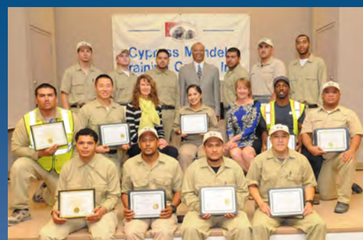
Graduates from Cypress Mandela earn state and federal certifications in environmental management.