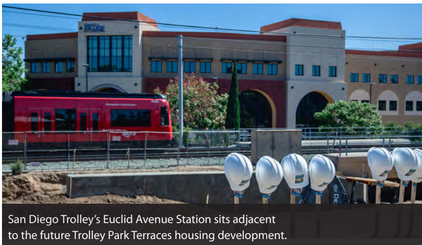
San Diego Trolley's Euclid Avenue Station sits adjacent to the future Trolley Park Terraces housing development.