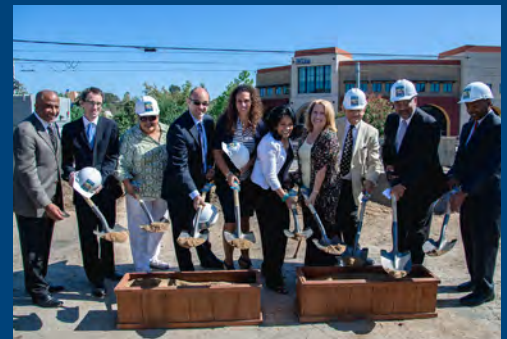
Local, state, and EPA partners participate in community ground breaking event for Trolley Park Terraces.

The Jacobs Center for Neighborhood Innovation is successfully leveraging multiple EPA and non-EPA resources to develop 50-acres in the underserved Diamond/Encanto neighborhoods in San Diego, CA. The development will offer a mix of commercial space and affordable and market-rate housing. After years of extensive community outreach, a 52-unit affordable housing development, Trolley Park Terraces, will provide affordable rental housing adjacent to the transit station. This first phase of redevelopment will create over 150 construction jobs.