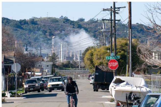
A Richmond, CA community disproportionately affected by pollution emitting source.

The community of focus for the Climate Action Engagement Project which was funded by a $25,000 Environmental Justice Small Grant from the Environmental Protection Agency, is