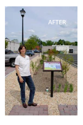
Project Partners: Town of Ashland, Chesapeake Bay Trust, U.S. Environmental Protection Agency