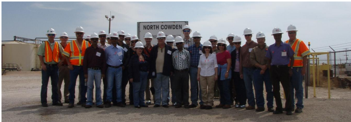
Exhibit 2: Study tour participants and Oxy representatives outside of the North Cowden facility.

EPA and Gazprom have recently co-authored a paper describing opportunities to reduce methane emissions in the natural gas transmission sector.