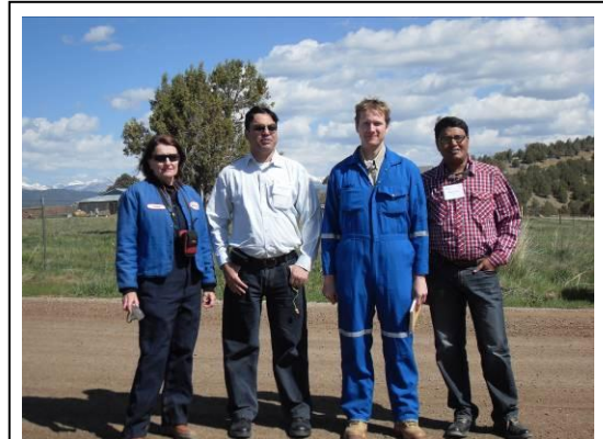
Exhibit 1: Study tour participants and a ConocoPhillips representative near a well completion site.