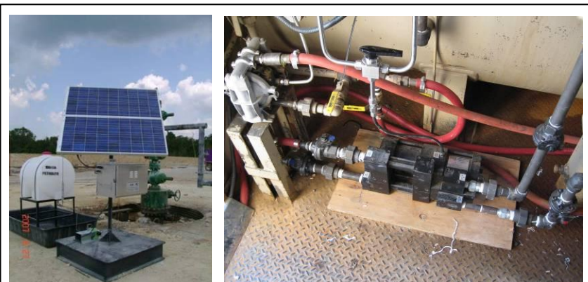
Exhibit 2: A SCADA-controlled solar chemical pump system (left). The HPGD pump (right) was tested at five Encana facilities as a possible option instead of a solar-powered pump.

One alternative would have been a solar-powered pump, but given high glycol circulation requirements, solar was not a suitable option due to a lack of battery power storage. Instead, the team identified a system that was driven pneumatically by natural gas. This system was