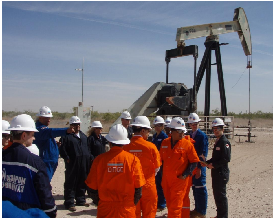
Exhibit 4: Study tour participants at an oil well using a sucker rod pump.