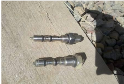
Exhibit 1: Comparison of Mizer (top) and existing pilot valve (bottom).

Since its formation, the Environmental Efficiency Program has allowed Encana to implement several wide-scale retrofit projects, including converting over 1,300 high-bleed liquid level