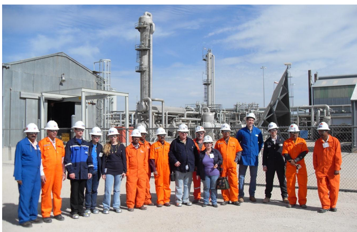
Exhibit 3: Study tour participants and Chevron representatives outside of the Headlee Gas Plant.