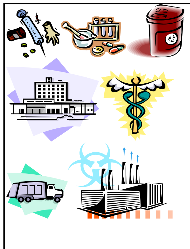
Printed on recycled paper