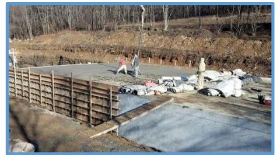
Construction of EPA-funded cistern to satisfy irrigation needs.

U.S. Environmental Protection Agency EPA Region 3 Water Protection Division Philadelphia, PA