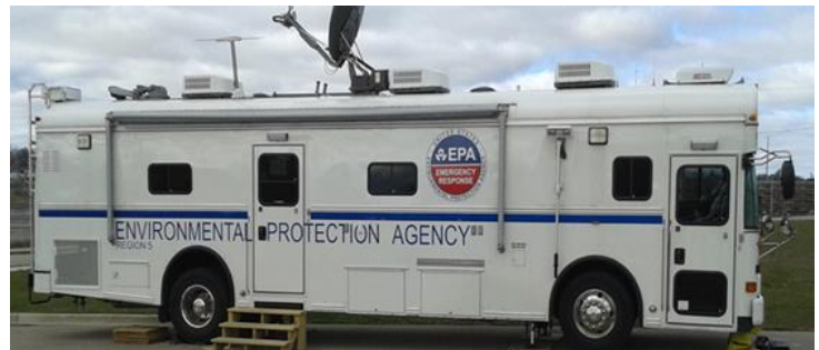
EPA emergency response vehicle in Flint.

In the absence of EPA intervention in Flint, the state continued to delay taking action to require corrosion control or provide alternative drinking water supplies. Additional data in August and September 2015 demonstrated lead contamination was widespread, and also demonstrated an increase in the blood lead levels of children living in Flint. It was not until December 2015 that Flint began adding a corrosion inhibitor to optimize corrosion control in the water system.