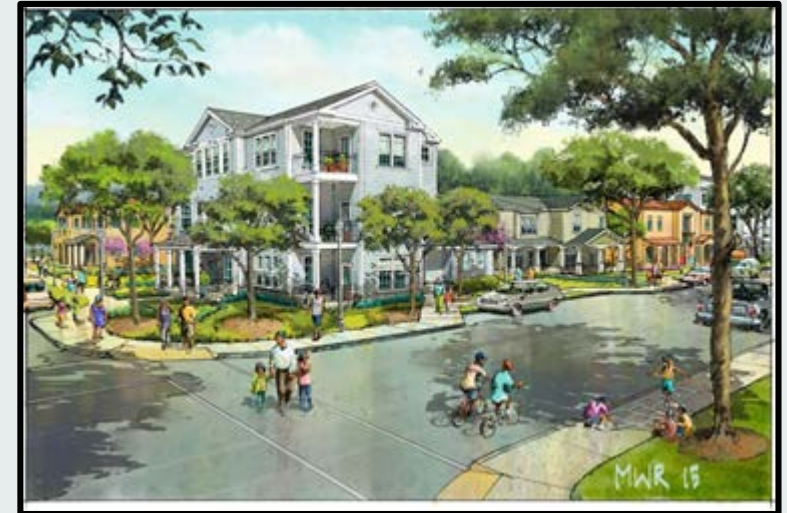
East Meadows I