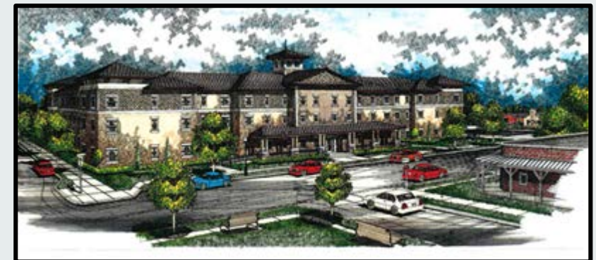
Wheatley Park Senior Living