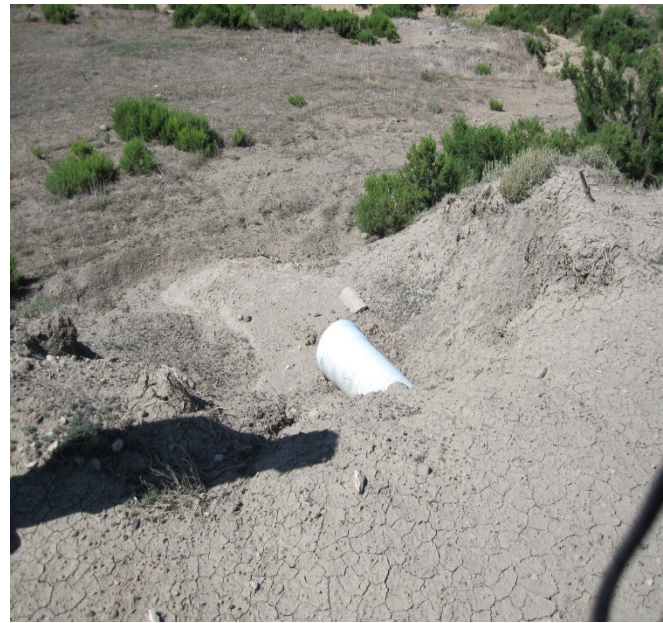
Outfall 001 from Holding Pit #3