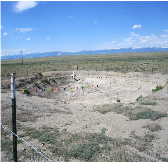
Holding Pit #3