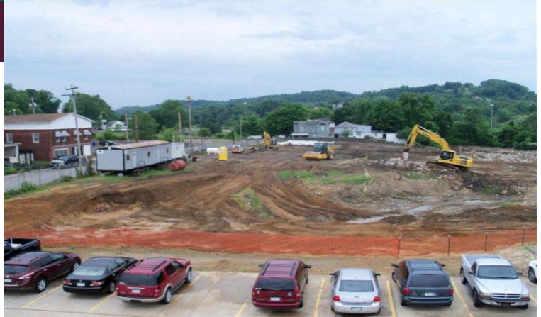
Above: Cleanup and Construction.

Adamston Commons, the shopping plaza, provides retail, commercial, and green space for the local community and spans 5.6 acres. The Commons hosts grocery hotspots, such as Save-A-Lot and Shop-N-Save, a Pizza Hut, and a Dollar Tree for the Adamston community and beyond. The retail outlet provides fresh and affordable groceries, both deli and baked goods, and retail products to the surrounding communities.