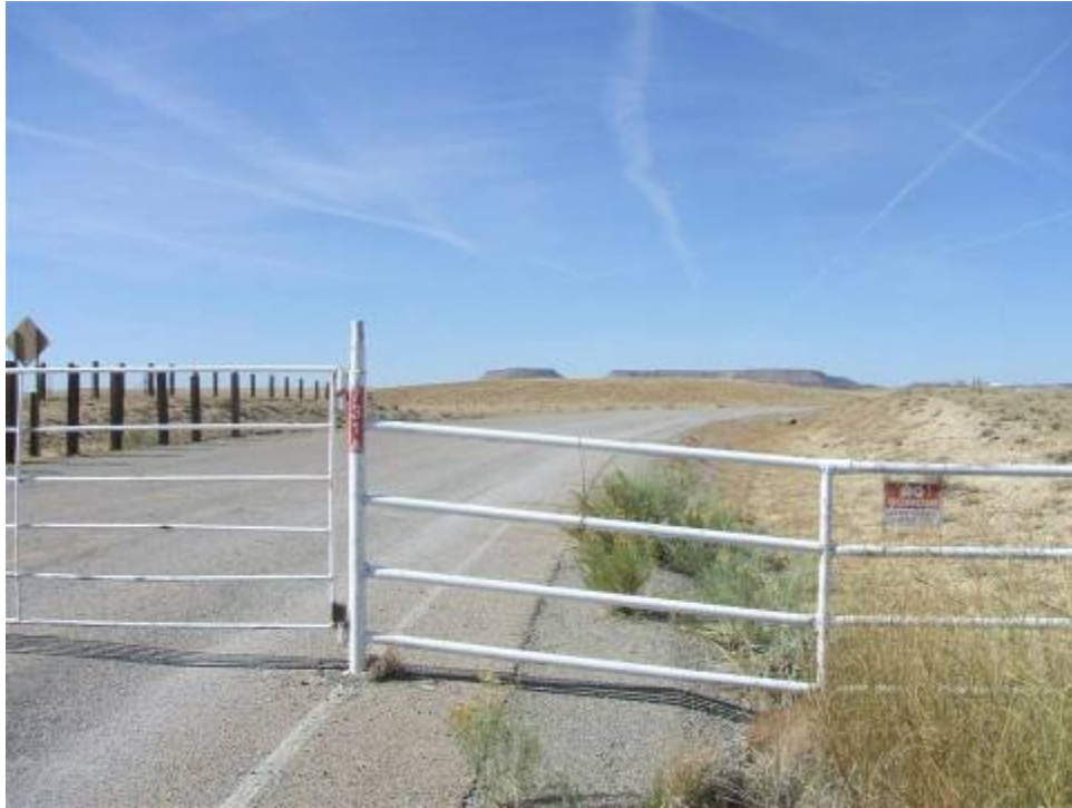
Photo 1. Locked gate on road leading towards Buckey mine site