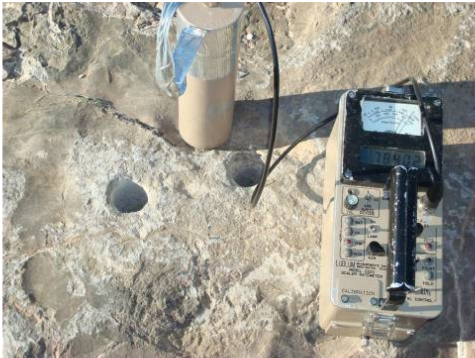
Photo 4. Red Cap mine site, bedrock exposure and blast holes