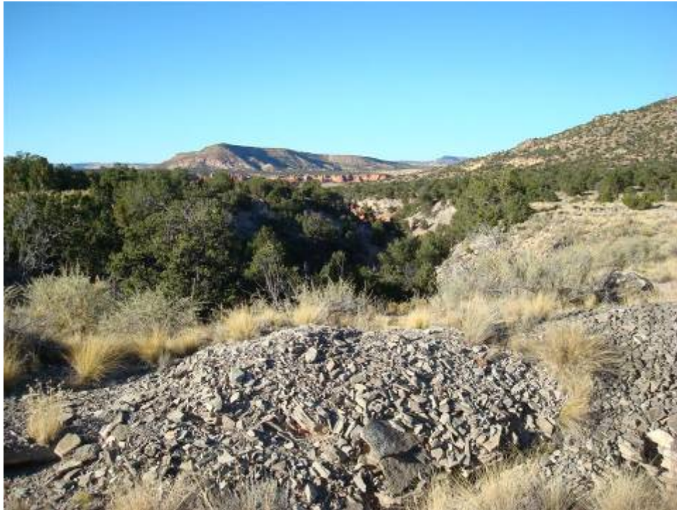
Photo 3. Red Cap mine site, waste rock piles