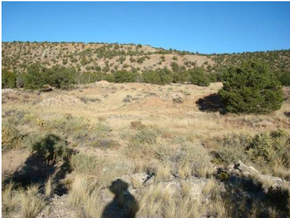
Photo 2. Red Cap mine site, towards the east