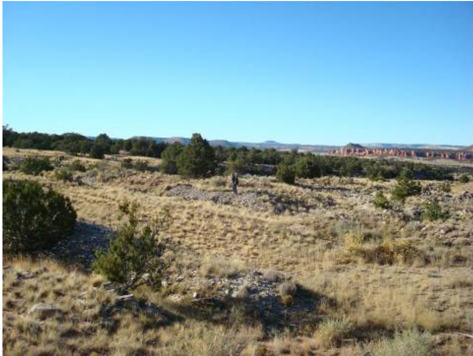
Photo 1. Red Cap mine site, towards the west