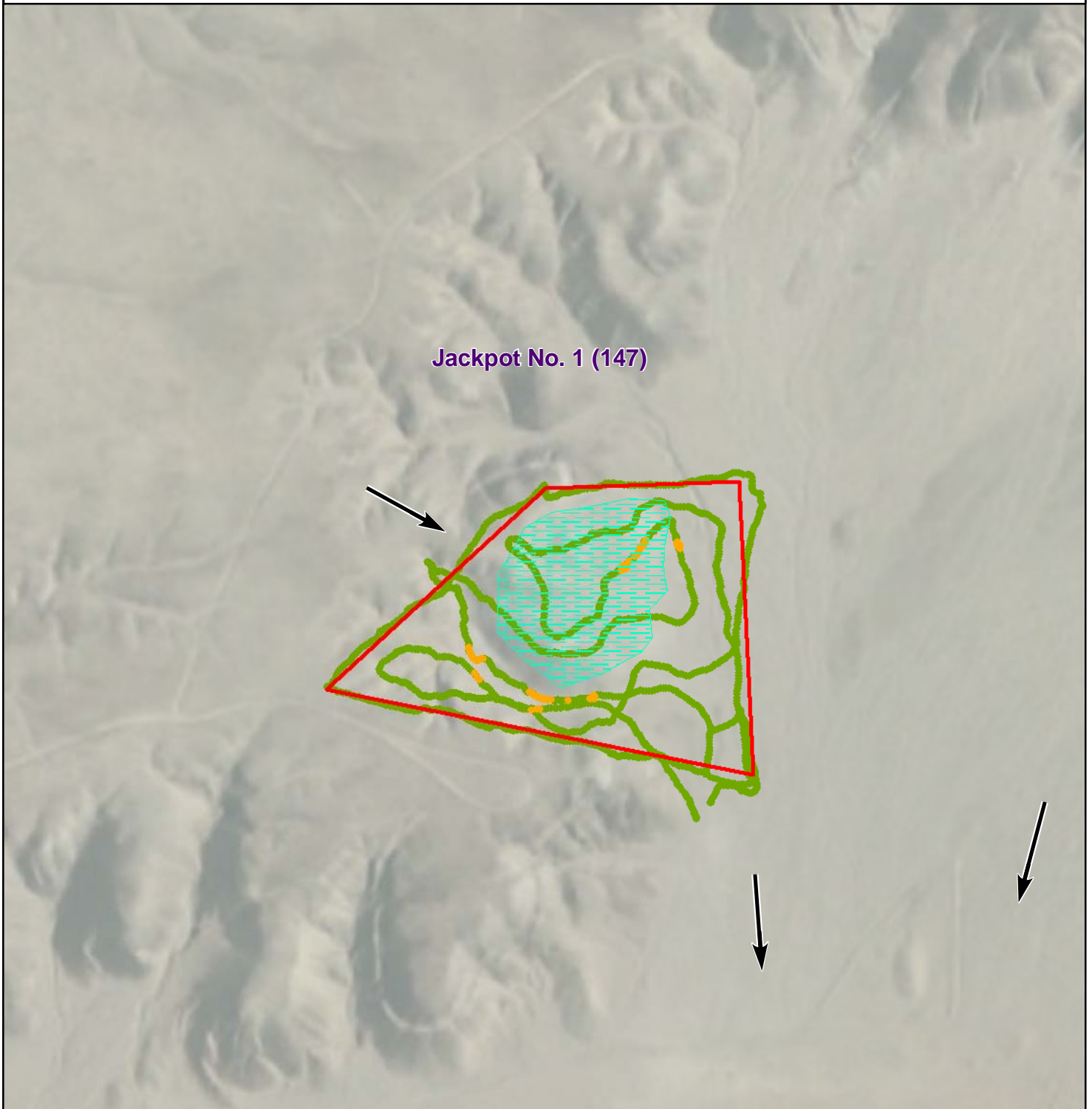
Figure 1 - Gamma Radiation Measurements, Above Two Times Background Jackpot No. 1 (147) Coalmine Mesa Chapter, Navajo Nation