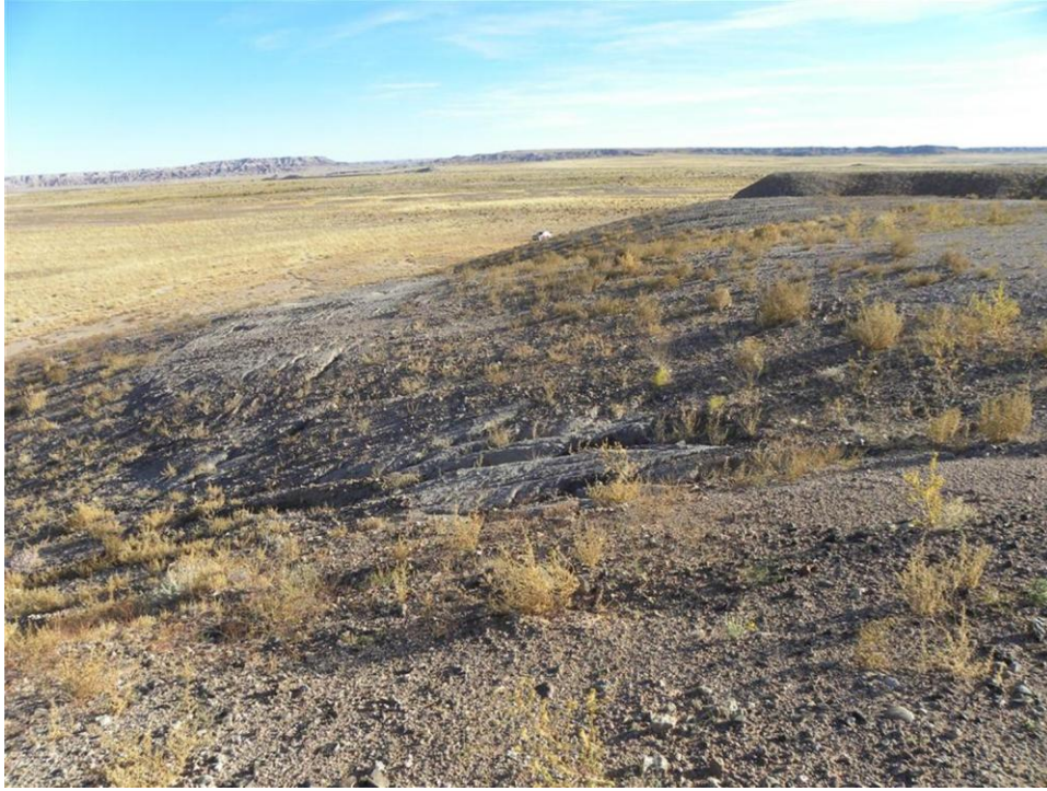
Photo 1. Jackpot No. 1 mine site