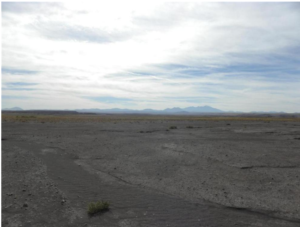
Photo 2. Ramco No. 24 mine site