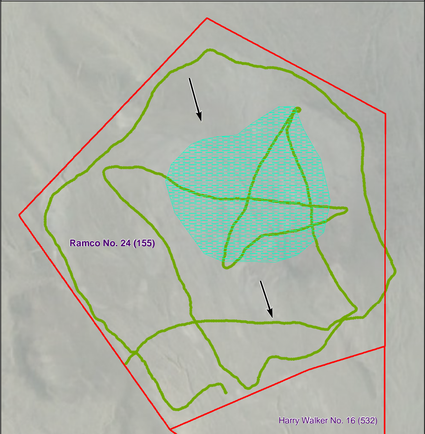
Figure 1 - Gamma Radiation Measurements, Above Two Times Background Ramco No. 24 (155) Coalmine Mesa Chapter, Navajo Nation