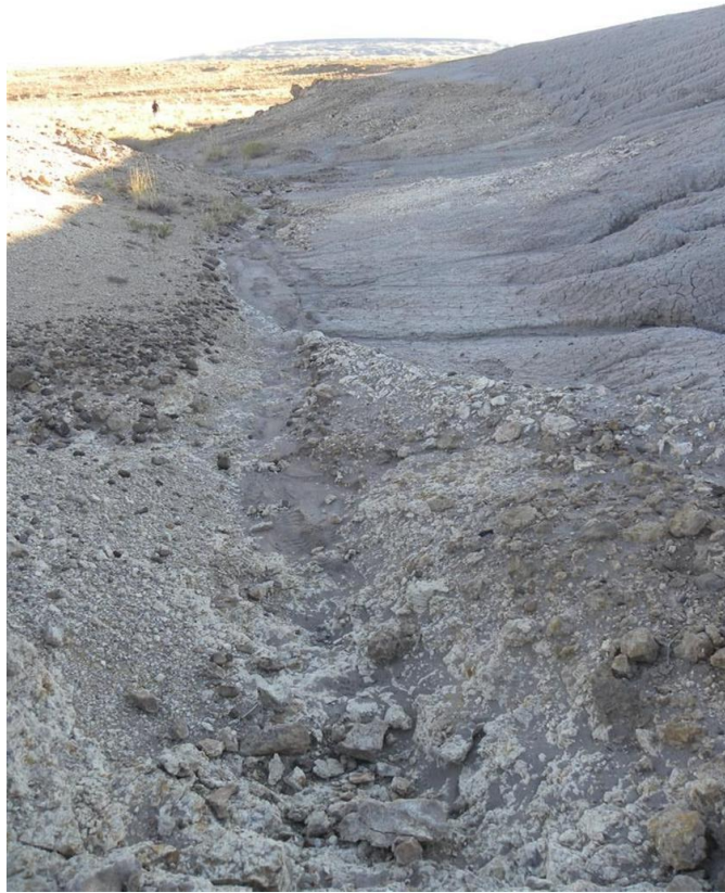
Photo 3. Boyd Tisi No. 1 mine site, drainage