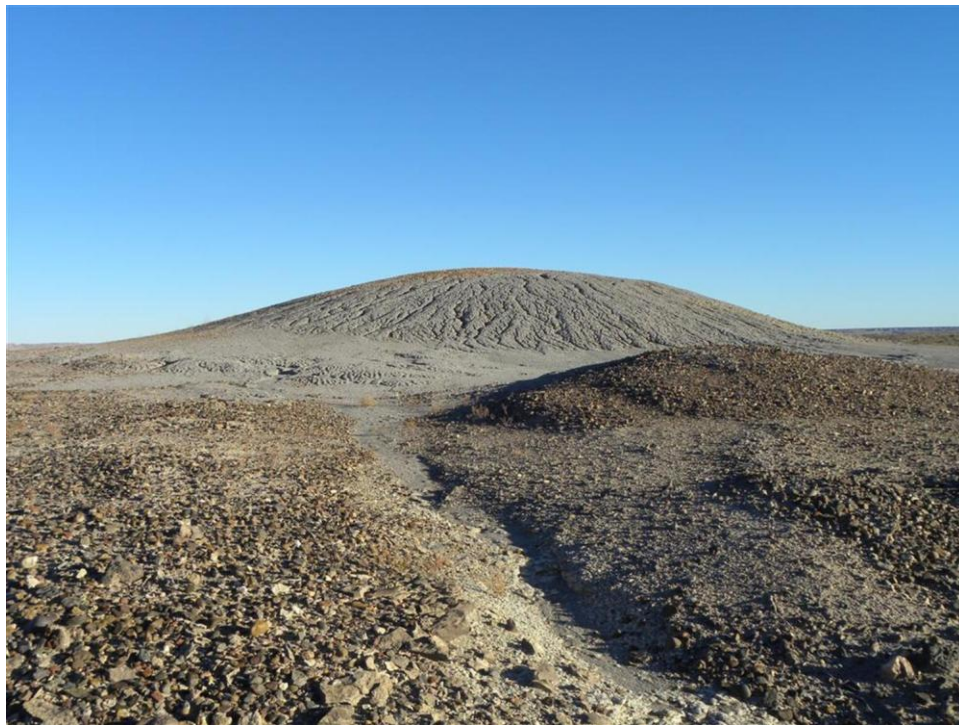
Photo 2. Boyd Tisi No. 1 mine site, reclamation cap