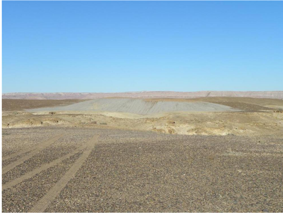
Photo 1. Boyd Tisi No. 1 mine site