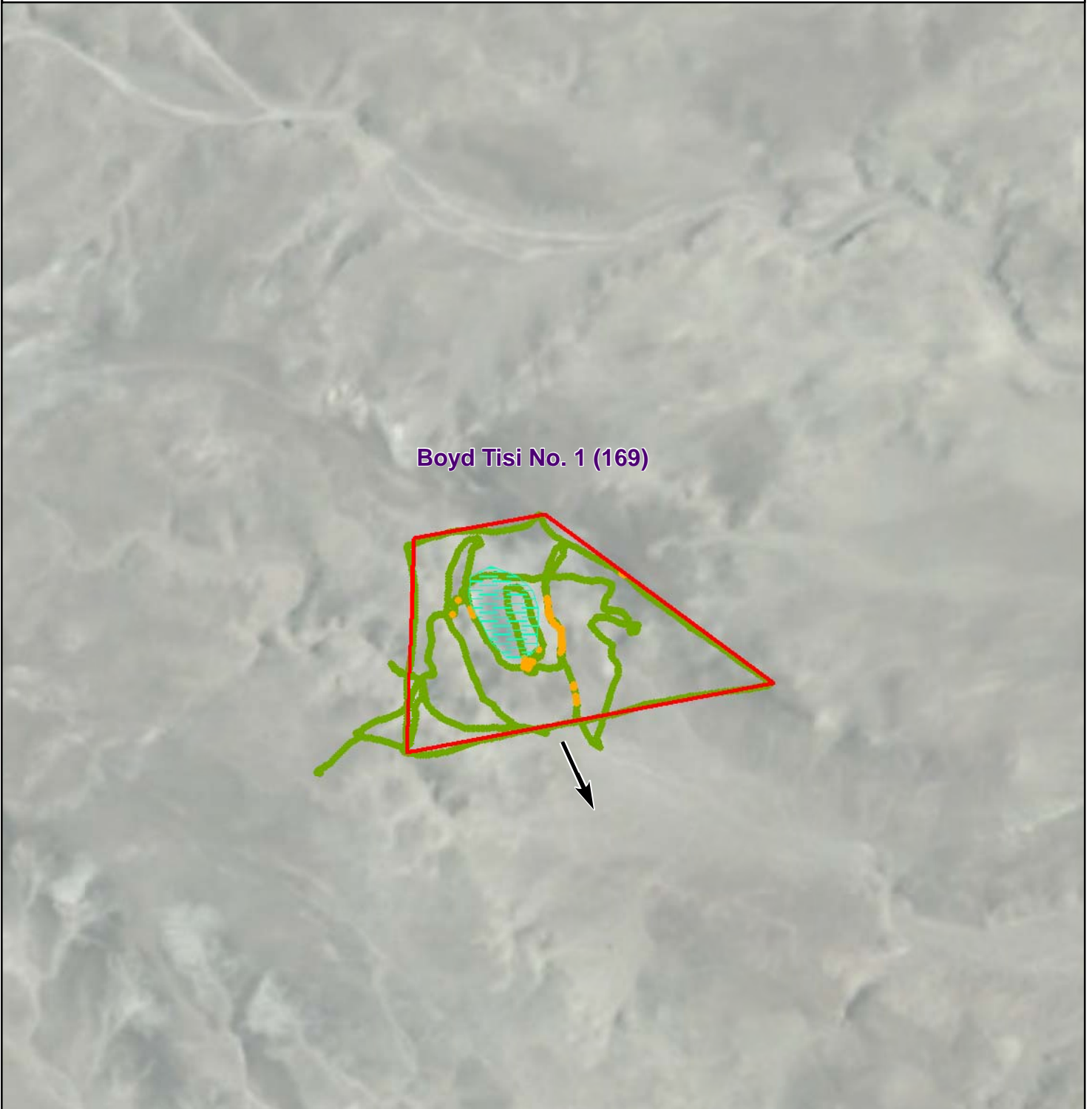
Figure 1 - Gamma Radiation Measurements, Above Two Times Background Boyd Tisi No. 1 (169) Cameron Chapter, Navajo Nation