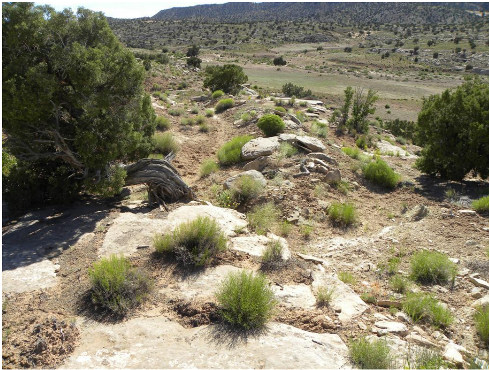
Photo 2. Brodie 1 site, berm area