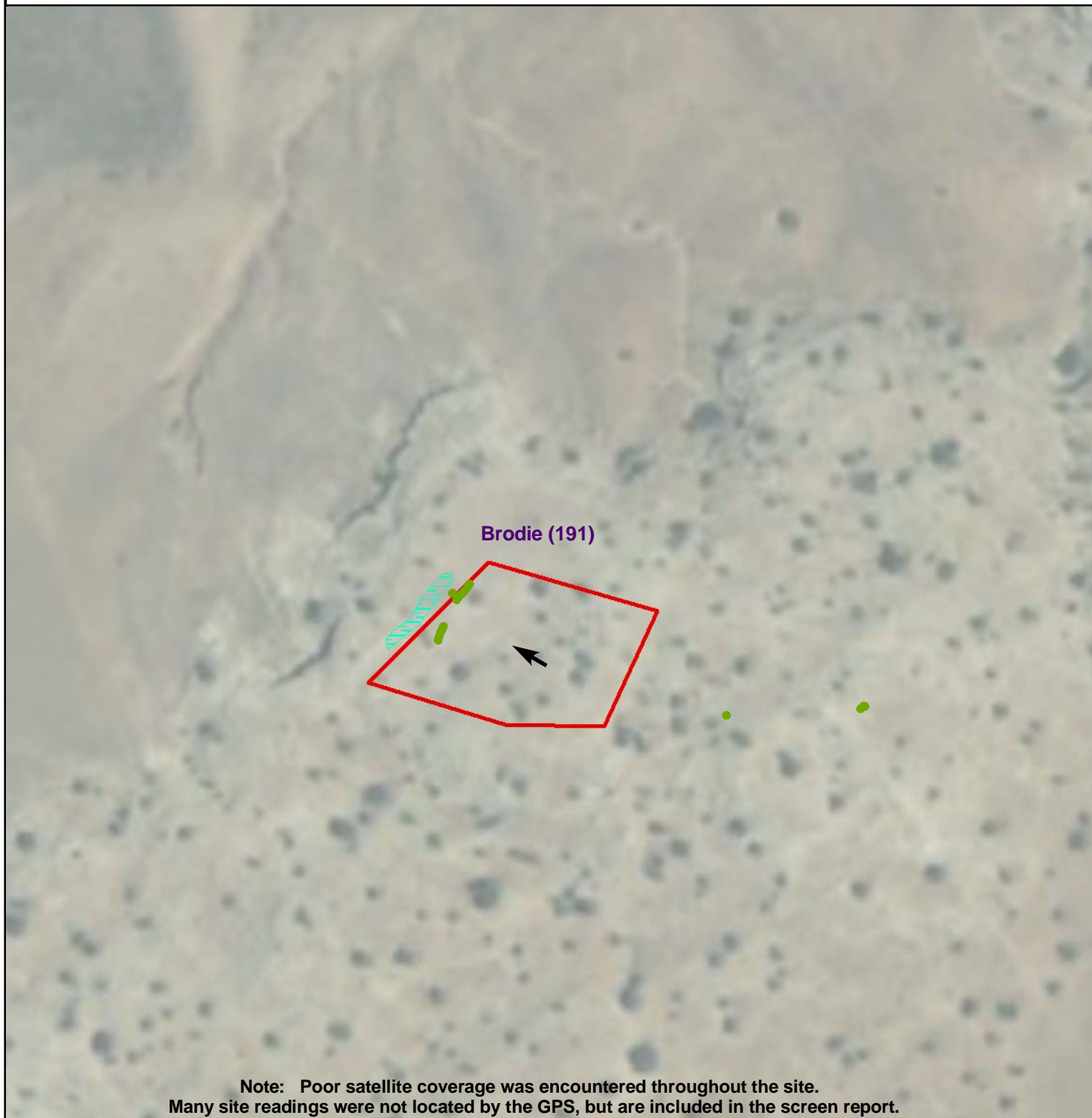
Figure 1 - Gamma Radiation Measurements, Above Two Times Background Brodie (191) Red Mesa Chapter, Navajo Nation