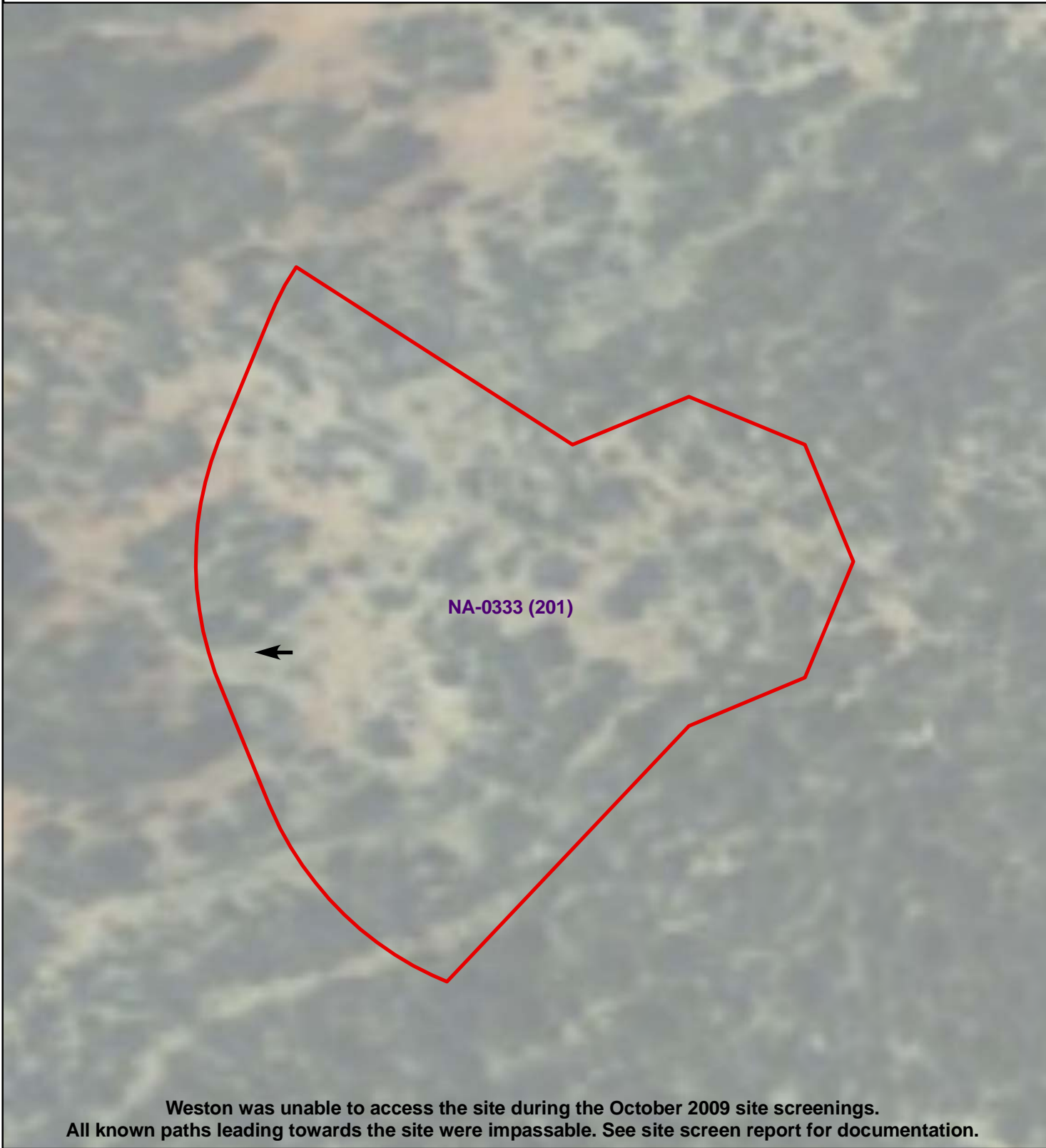
Figure 1 - Site Inaccessible NA-0333 (201) Round Rock Chapter, Navajo Nation, Arizona

Weston was unable to access the site during the October 2009 site screenings. All known paths leading towards the site were impassable. See site screen report for documentation.