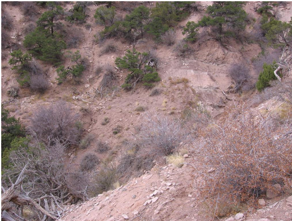
Photo 2. Steep grades towards mine site