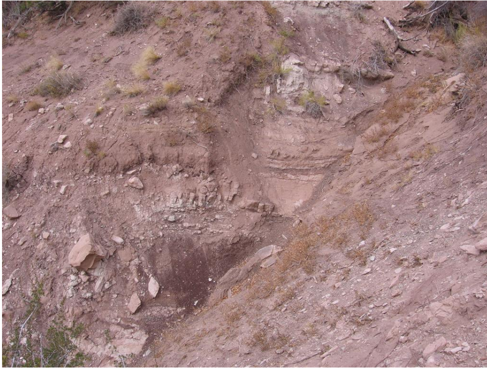
Photo 1. Walking pathway towards mine site washed out