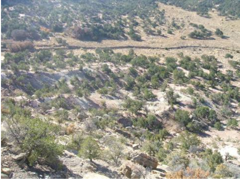
Photo 1. Mine site, from top of cliff area, towards the southeast